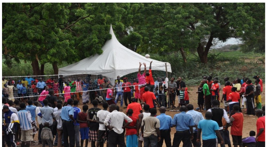
A volleyball game pitting agencies (in red) & refugees (in pink) as part of Olympic Games.