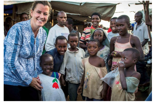
UN Deputy High Commissioner with Burundian refugees in Mahama camp.