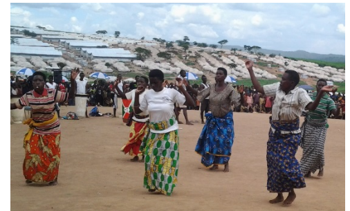
Burundian refugee women perform traditional dance in Mahama camp to launch SGBV Campaign.