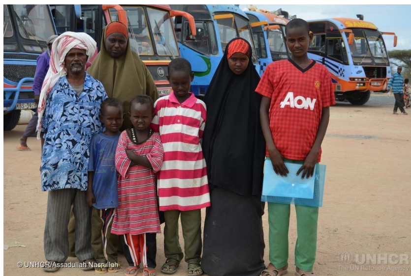
A refugee family from Dadaab camps ready to board buses to be transported to Somalia under the voluntary repatriation program.