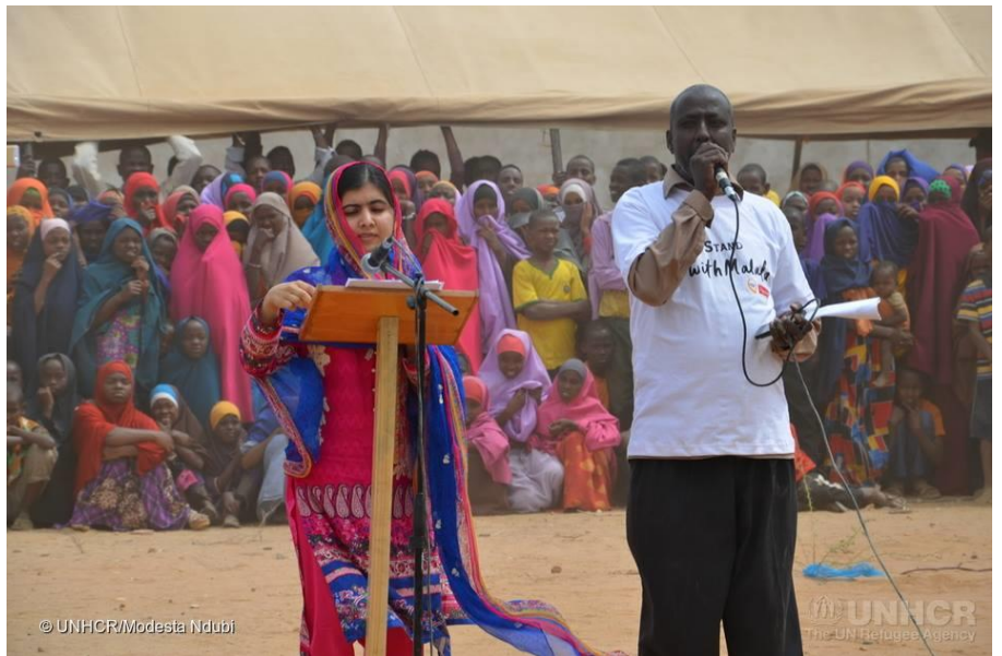
Malala Yousafzai talking to refugees during her visit to Dadaab camps.

Malala also interacted with secondary school girls, refugee leadership and education officers from various schools in the camp. One of the interactions was with 25 girls from different secondary schools who in April, had a Skype session with her courtesy of Vodafone Foundation’s Instant Network Schools leadership lessons programme.