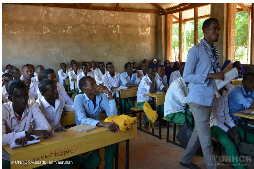
Students in their classroom at Hurmod Primary School, Ifo camp of Dadaab, Kenya.