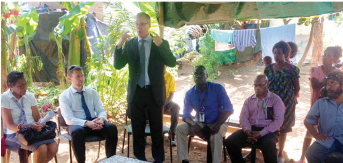
First meeting with West Papuan community with UNHCR regional representative.

The National Government has recently removed the citizenship application fee for refugees. The Immigration and Citizenship Service Authority, with assistance from the United Nations High Commissioner for Refugees, is currently working to assist all refugees in Papua New Guinea to be registered and apply for citizenship or a visa. Once they take up citizenship they will no longer be refugees and instead will be fellow Papua New Guineans, sharing the culture of their new home country.