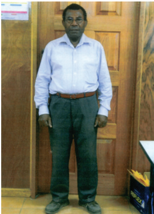
A successful West Papuan.

Many refugees establish businesses that create new job opportunities for local people and generate revenue for the Government.