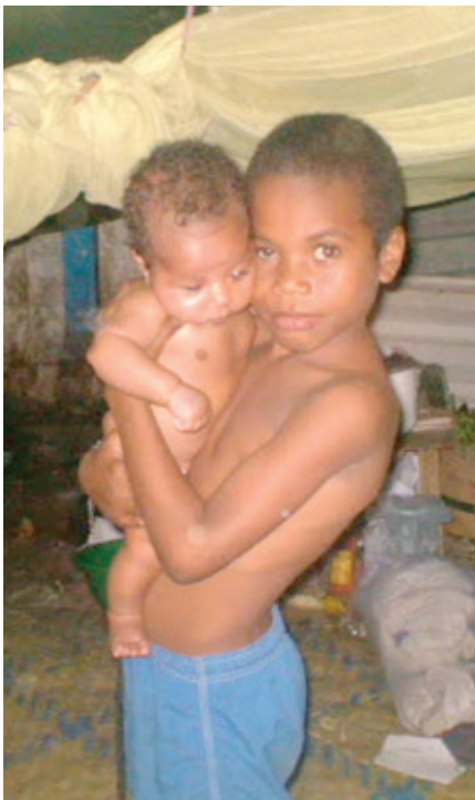
West Papuan children in PNG.