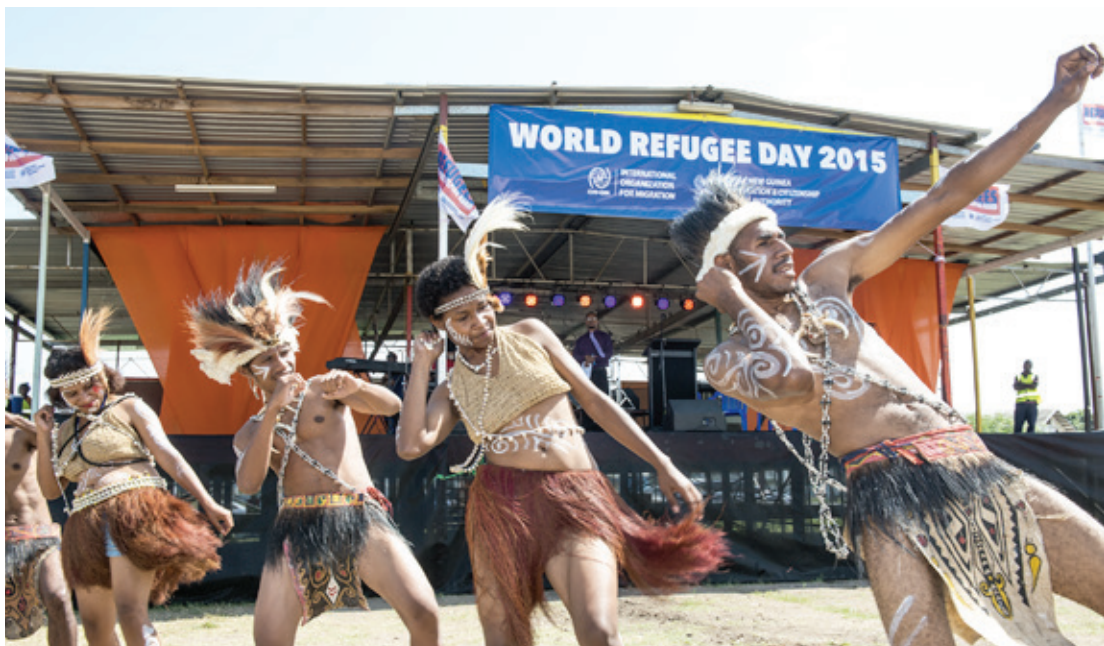
West Papuan dancers at the World Refugee Day 2015.

Arrangements for non-refugees are not addressed within this policy and are covered in existing law.