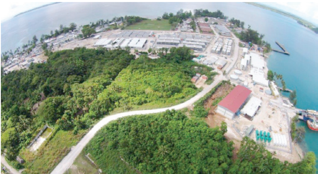
Manus Regional Processing Centre for asylum seekers.

The Government of Papua New Guinea makes the final determination of who is permitted to be processed and settled here. Durable solutions for those not eligible to remain in Papua New Guinea will be arranged with relevant parties.