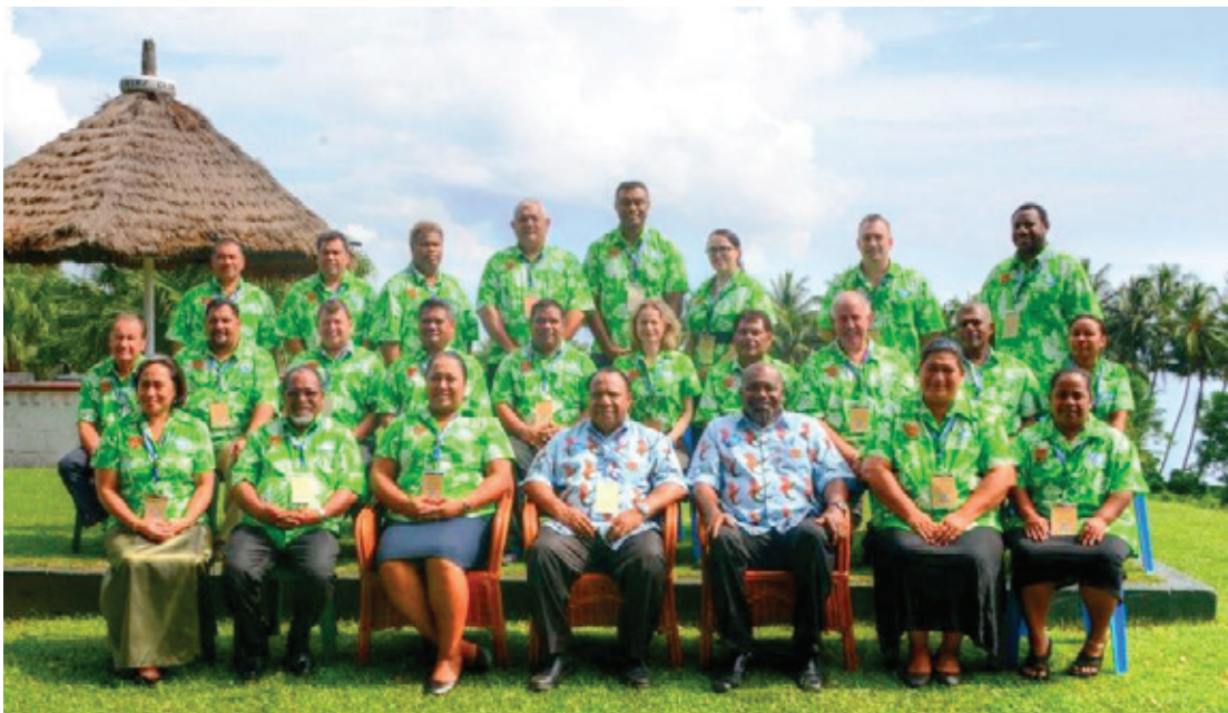
2014 annual meeting of the Pacific Immigration Directors Conference, hosted by Papua New Guinea.

As part of the global refugee protection framework, Papua New Guinea is a signatory to relevant international instruments, including: the Universal Declaration of Human Rights; the International Covenant on Civil and Political Right; the Convention on the Rights of Children; The Convention on the Elimination of all Racial Discrimination; the Convention on the Elimination of all Forms of Discrimination against Women; and the International Covenant on Economic, Social and Cultural Rights. Papua New Guinea will consider accession to other relevant treaties.