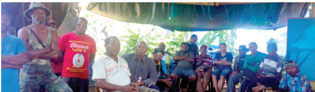
First meeting with West Papuan community with UNHCR regional representative.

Refugees also share the same responsibilities as other residents of Papua New Guinea. They must respect our laws, maintain the peace, respect other people, respect our cultures and traditions, and respect our Christian heritage.