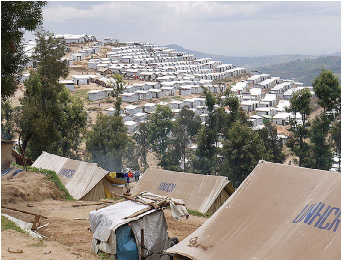
Kigeme Refugee Camp.

Papua New Guinea will explore options to invite refugees from camps around the world, who have appropriate skills to contribute to national development, to resettle in Papua New Guinea. Priority will be given to refugees and their families that have skills that are in high demand in Papua New Guinea.