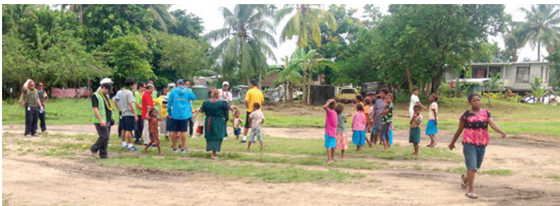
COPP (Community Orientation Preparatory Program) for transferees on Manus Island.

As most land in Papua New Guinea is traditionally owned, refugees who wish to engage in traditional farming must do so on designated state land. The National Government has allocated 6,000 hectares of land at East Awin in Western Province for long-term Melanesian refugees to support themselves through traditional farming. Refugees may also enter into arrangements with land owners to obtain access for farming in accordance with appropriate laws.