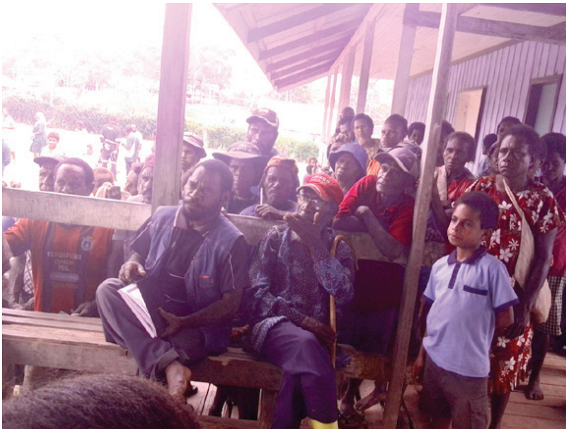
West Papuans in East Arwin.

Papua New Guinea has already implemented significant legislative amendments, including to: remove citizenship application fees for refugees; establish a refugee status determination process; create a refugee visa; give work rights to refugees; enable regional processing arrangements for asylum seekers; and criminalise people smuggling and trafficking.