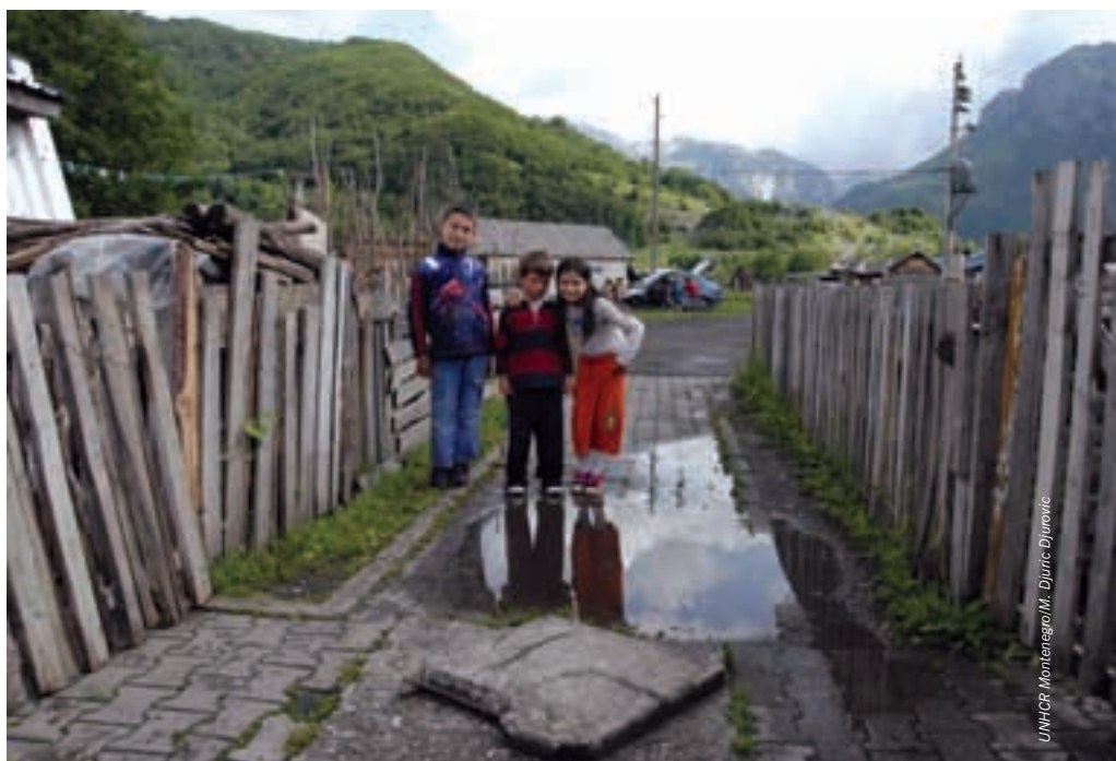
Refugee children from Bosnia and Herzegovina living in a family settlement in Vrujy, in a remote area in Montenegro.

In the Western and Central Europe, including the Baltic States , UNHCR will focus on influencing asylum law, policy and practice at both national and European Union levels. Offices in European capitals play a key role in the debate on the external dimension of the EU asylum policy, upholding UNHCR's protection mandate. In this regard, the promotion of resettlement, where available, will receive particular attention. The Office seeks to improve monitoring and input into judicial processes that affect not only individual refugees' lives, but set precedents and best practice. UNHCR will cooperate with EU institutions and the Council of Europe to address statelessness both within and outside the European Union.