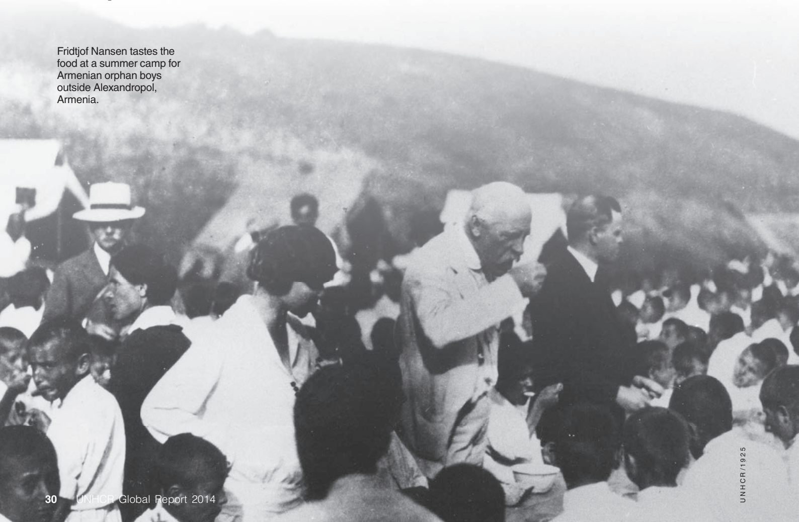
Fridtjof Nansen tastes the food at a summer camp for Armenian orphan boys outside Alexandropol, Armenia.