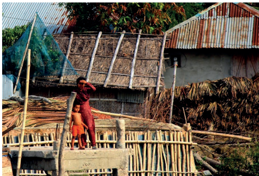
A community in Dacope, Bangladesh, affected by Cyclone Aila in 2009 is still living on low-lying embankments – vulnerable to hazards including cyclones and tidal surges.

The 1951 Convention Relating to the Status of Refugees notes that owing to "a well-founded fear of persecution" on the grounds of race, religion, nationality, membership of a particular social group or political opinion, a person may seek and be granted protection. Natural disasters or climate change, however, are not included among these grounds for protection.