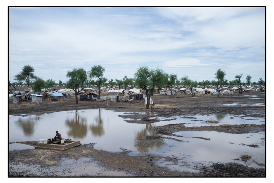
Yusuf Batil refugee camp, South Sudan (© 2016 anonymous photographer/IRRI).

Field research was carried out in collaboration with NHRMO. Interviews were carried out with 36 civilians from different areas in Blue Nile State, and from different, though predominantly "indigenous" Funj,<sup>3</sup> communities. Most interviewees were refugees in South Sudan, but internally displaced and non-displaced civilians in Sudan were also interviewed. Most interviews were conducted in Arabic, a few were conducted in English, and some were also conducted in Uduk and Jumjum, with translation into English. In addition, interviews were also carried out with individuals affiliated with NGOs working in South Sudan or Blue Nile, and with some SPLM-N officials. Desk research was carried out in order to contextualise the findings.