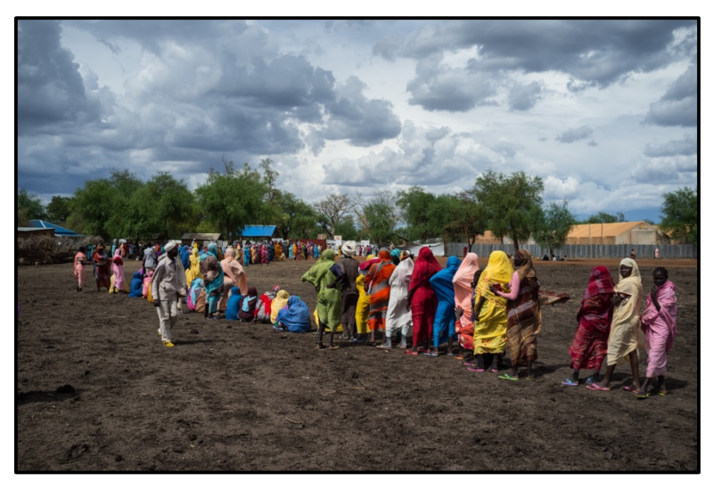
Clothes distribution in Gendrassa refugee camp, South Sudan (© 2016 anonymous photographer/IRRI).

Perhaps the most evident impact of the displacement, on those civilians who had to leave their homes, has been the loss of livelihoods and and the property, growing dependency on aid. As most communities maintained an agropastoral lifestyle before they fled, the loss of land, and in many cases also livestock, has been critical.<sup>129</sup> A community leader in Yusuf Batil explained: "We were farmers. We could provide for ourselves. We raised cattle. These are the two things we were dependent on. When this