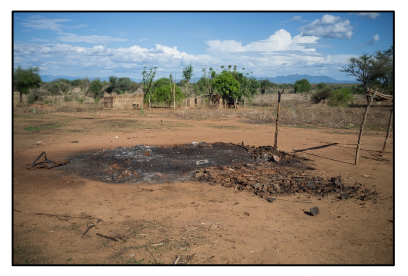
A burnt hut in a village in southern Kurmuk County, days after the it was bombed, May 2016 (© anonymous photographer/IRRI).

Although many civilians have learned to recognise the sound of approaching planes and have dug foxholes in an attempt to provide themselves with some shelter during raids, the bombs still often claim lives or cause terrible injuries, kill livestock, and destroy crops and private property. In addition, the indiscriminate nature of the attacks, and the fact that they can take place at any time, has had a terrible psychological impact on the population. The sound of the planes, sometimes lingering in the