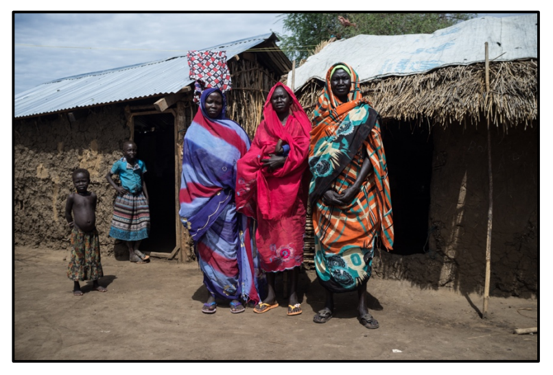
Women from Wadaka (Kurmuk County, Blue Nile) in Doro refugee camp (© 2016 anonymous photographer/IRRI).

Nile," explained one refugee living in Doro.<sup>68</sup> Another refugee from Roseires argued that "the original Sudanese are Funj."<sup>69</sup>