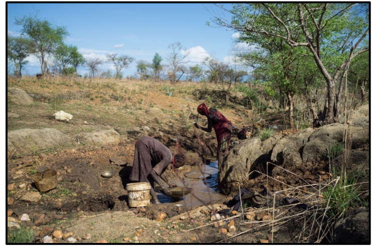
Artisanal gold mining in southern Kurmuk County, Blue Nile State, May 2016.

Under these circumstances, humanitarian assistance in the SPLM-N held territories is extremely limited, and the few local organisations operating in these areas refrain from publishing information on the amount of assistance that they are providing. A few local initiatives of humanitarian assistance were mentioned by