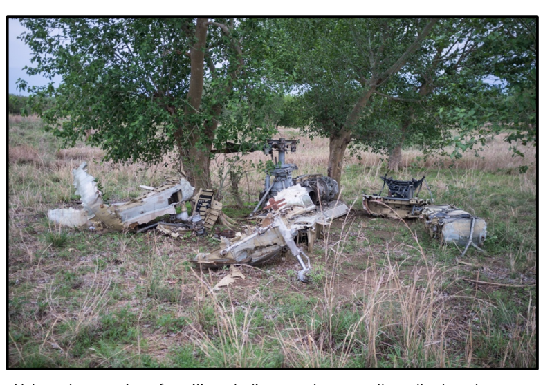
Yabus: the remains of a military helicopter that was allegedly shot down during fighting in 1996 (© 2016 anonymous photographer/IRRI).

The CPA provided a formula for democratic transformation and the creation of a "New Sudan". The transitional period was designed to allow these changes to take root and to build confidence between the north and the south. Southerners, however, were given the option of a referendum and secession in the event that these changes were not implemented to their satisfaction. The north-south division in the CPA was based on