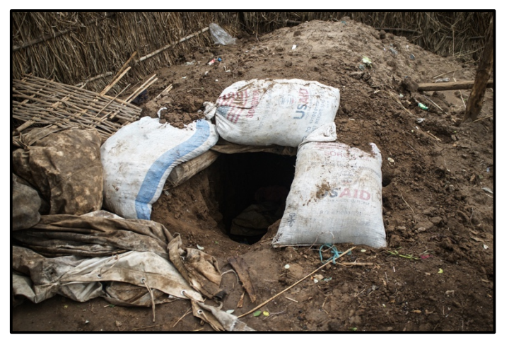
A shelter in a village in southern Kurmuk County, Blue Nile, May 2016.

The conflicts in Darfur, Southern Kordofan and Blue Nile have been ongoing for years, and there are no signs that Khartoum intends to change its national priorities or ruling model any time soon in order to bring them to an end. Negotiations on peaceful solutions to the conflicts in the Two Areas have repeatedly collapsed, and neither side appears to be able to bring the