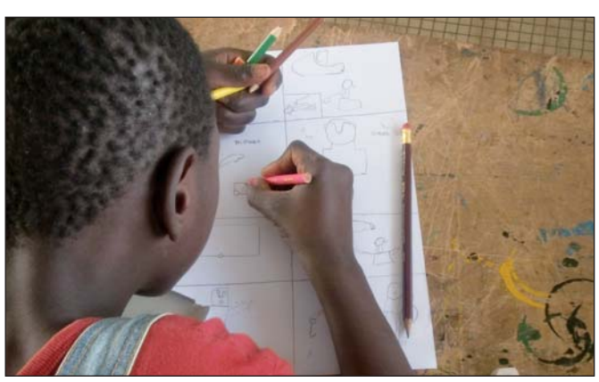
Psycho-social support in the form of an art workshop taking place at a shelter for child victims of trafficking

Prevention measures should include providing children and their families with information about migrants' rights, about the risks of irregular migration and the risk of trafficking (see Chapter 7 ). In high emigration areas, this information can effectively be provided at school. Capacity building of border guards and immigration officials is important to ensure that border crossing does not constitute a threat for children travelling alone and that children who are being trafficked or are in the hands of smugglers can be identified at border crossings. Children on the move, who do not have access to identity or travel documents, are often considered and treated as migrants moving irregularly or as juvenile delinquents, which seriously hinders the realisation of their rights . These children may become subject to criminal prosecution, detention or unsafe repatriation.