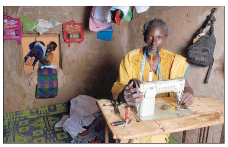
Supporting local integration through income generating activities

These three traditional durable solutions complement each other and can be strategically combined to provide a comprehensive solution to a particular refugee community. Beyond these classic durable solutions, legal migration opportunities are also increasingly being discussed as another opportunity for some refugees to re-build their lives in a new country.