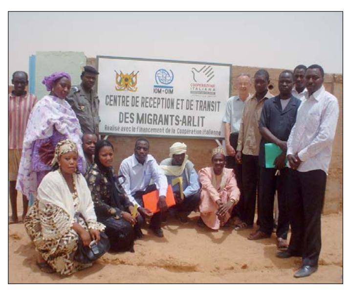
Opening of the Arlit transit centre in Agadez, Niger. See example p.91

Actors coming into direct contact with persons on the move will rarely be in a position to provide them with all the necessary services, and will therefore need to refer them to other actors for complementary action. An individual might also come into contact with one actor, but fall under the mandate of another, or under several mandates. A multidisciplinary and cross-sectoral approach is therefore essential to the development of an effective referral mechanism. The basic aims of a referral mechanism are to ensure that the human rights of persons in need of assistance and protection are respected, and to provide an effective system to refer the individuals concerned to appropriate services. Potential services required may include: legal aid, counselling, specialised medical treatment, or any other specific type of assistance. Developing an effective referral mechanism also requires identifying the