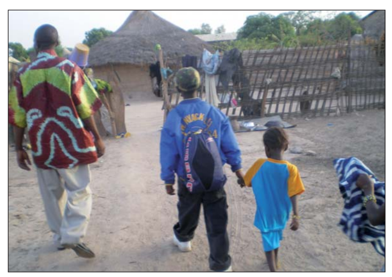
A boy who benefited from the IOM Regional Return and Reintegration Program is reunited with his family

IOM has been providing counter-trafficking services for several decades. Throughout the world, IOM has implemented almost 500 counter-trafficking projects in 85 countries and has provided assistance to approximately 20 000 victims of trafficking. In West Africa, IOM has implemented several projects to combat trafficking at the regional and at the national levels. From 2006 to 2010, IOM implemented the Regional Program of Assistance for the Return and Reintegration of Children Victims of trafficking in West Africa, which supported the return of close to 600 children. IOM has also participated in the funding of the activities of the Child Mobility Platform (see Chapter 9) which aims at better understanding the complexities of child mobility in the region. IOM considers the "3 Ps" approach as a best practice model for combating trafficking. A comprehensive strategy includes efforts to Prevent the crime, to Protect the victims and to Prosecute the traffickers.