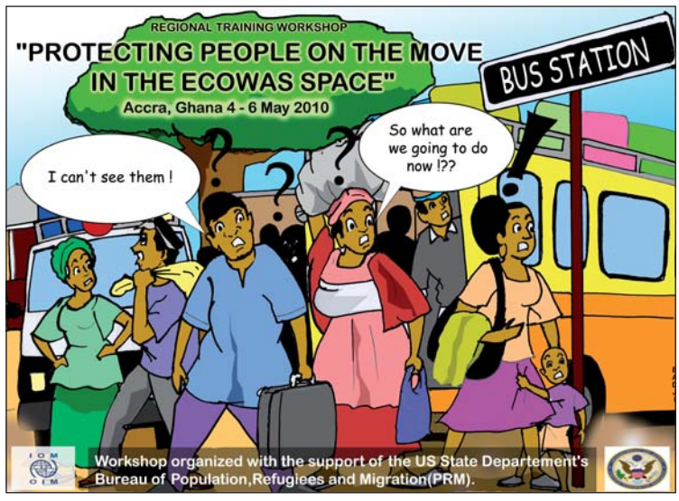
Poster designed for the Accra regional workshop "Protecting People on the Move in the ECOWAS Space"

The first two workshops, organized by IOM, in cooperation with UNHCR, ECOWAS, ILO, OHCHR and UNICEF, were entitled "Protecting People on the Move in the ECOWAS Space" and took place in Ouagadougou (April 7-9) and Accra (May 4-6). These workshops targeted representatives of ECOWAS member states and civil society organizations from two groups of countries: Benin, Burkina Faso, Niger and Togo on one hand, and Ghana, Liberia, Nigeria and Sierra Leone on the other. Later in the year, UNHCR and the ECOWAS Commission, in cooperation with IOM, OHCHR, ILO and UNICEF, organized two additional regional workshops under the title "Protecting Refugees and other People on the Move in the ECOWAS Space", which targeted the seven remaining ECOWAS countries, namely Guinea, Mali, Cote d'Ivoire and Senegal (Dakar-November 3-5), and The Gambia, Guinea Bissau and Cape Verde (Bissau, November 9-11).