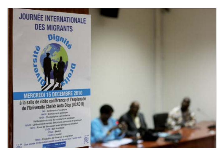
Celebration of International Migrants Day 2010, Dakar, Senegal

human rights standards at the centre of migration considerations and international migration policy and management, making use of existing human rights mechanisms to protect migrants and other persons on the move from the human rights violations they may suffer at the different stages of the migratory process. The human rights impact of migration policies and practices must be assessed and taken into account in the formulation and implementation of policies and measures to promote inclusion, protection, and acceptance of migrants and other persons on the move in society. This approach requires an analysis of the ways and means by which human rights are violated, the identification of the rights-holders and the corresponding duty-bearers, an assessment of and compensation mechanism for discriminatory practices, and a strategy that puts the international human rights of persons on the move and the corresponding obligations of the state at the centre of the national debate.