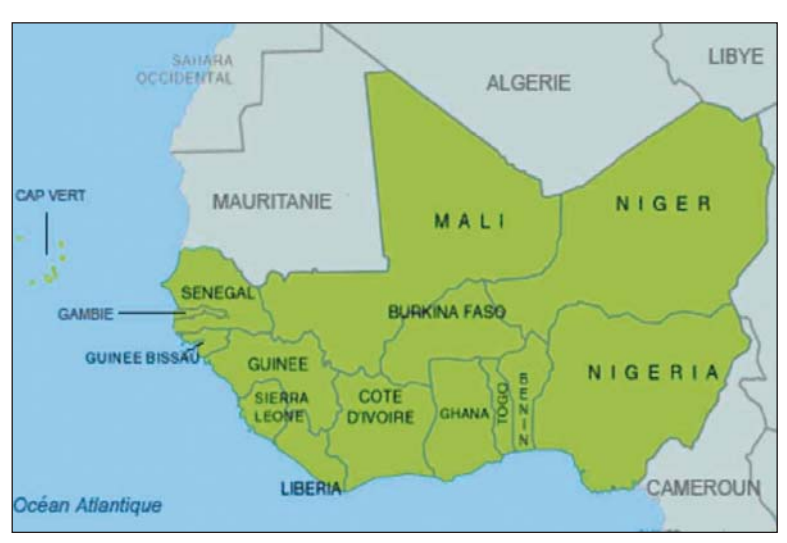
The 15 ECOWAS Member States (in green on the map), GéoAtlas Map/RFI

The Economic Community Of West African States (ECOWAS) is a regional group of fifteen countries, founded in 1975. Its member states are Benin, Burkina Faso, Cape Verde, Côte d'Ivoire, The Gambia, Ghana, Guinea, Guinea Bissau, Liberia, Mali, Niger, Nigeria, Senegal, Sierra Leone and Togo. The ECOWAS Treaty was adopted in May 1975 and revised in 1993. The mission of the ECOWAS is twofold: 1 – to promote cooperation and integration, with a view to establishing an economic and monetary union as a means of stimulating economic growth and development in West Africa; 2 – to consolidate states' efforts to maintain peace, stability and security in the region.