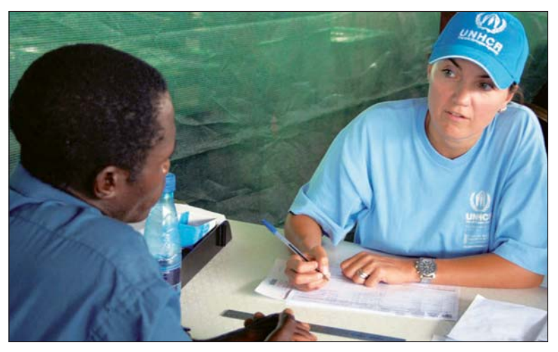
Individual interview to assess international protection needs

To be recognized as a refugee, the individual must satisfy all elements of the 1951 refugee definition , which key elements are the following: