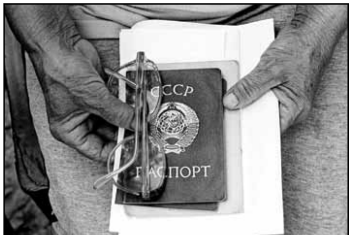
The break-up of the Soviet Union created legal and bureaucratic obstacles that still affect people today. Here, a woman from Ukraine holds her expired Soviet passport.

In summary, USCIS statistics provide that, during fiscal years 2005 to 2010, in addition to asylum applications from stateless persons pending at the outset of 2005, 628 stateless persons sought asylum affirmatively at the asylum offices, 102 283 stateless persons were granted asylum, 23 were denied asylum, and 359 had no final decision reached on their application, but were instead placed in removal proceedings 103 and referred to immigration court to have their asylum claim decided by an immigration judge. 104 The EOIR statistics for the same six-year period indicate that 1,087 stateless persons sought asylum defensively before the immigration court, 463 stateless were granted asylum, 166 were denied such relief, and 295 either abandoned or