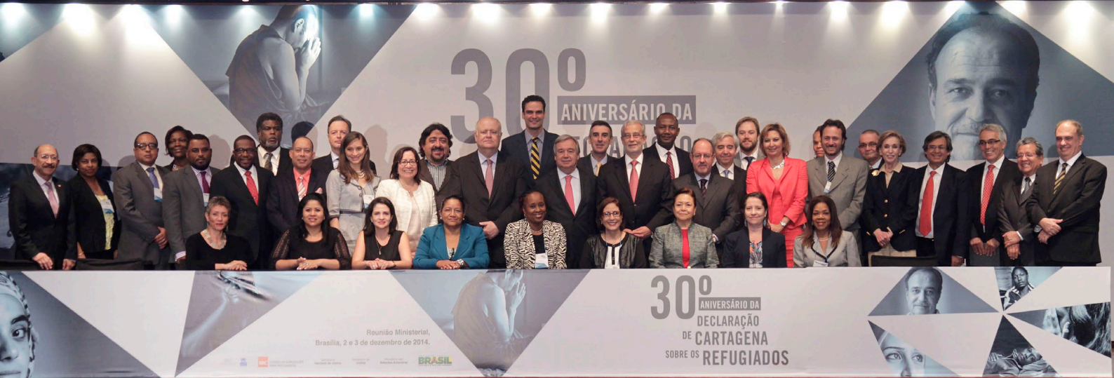
Group photo of the closing ceremony of the Ministerial Meeting in Brasilia, which saw the adoption of the Declaration and Plan of Action of Brazil.

The Campaign was also front and centre during a hearing on statelessness of the European Parliament's Subcommittee on Human Rights on 21 January 2015. Specific actions discussed during the hearing included adoption of a resolution by the European Parliament and development of a Framework on Statelessness by the EU to guide its foreign policy on the issue and to complement UNHCR's Campaign. UNHCR also called on EU Member States to address gaps in their respective nationality laws, introduce determination procedures to protect stateless persons and accede to the two UN statelessness conventions.