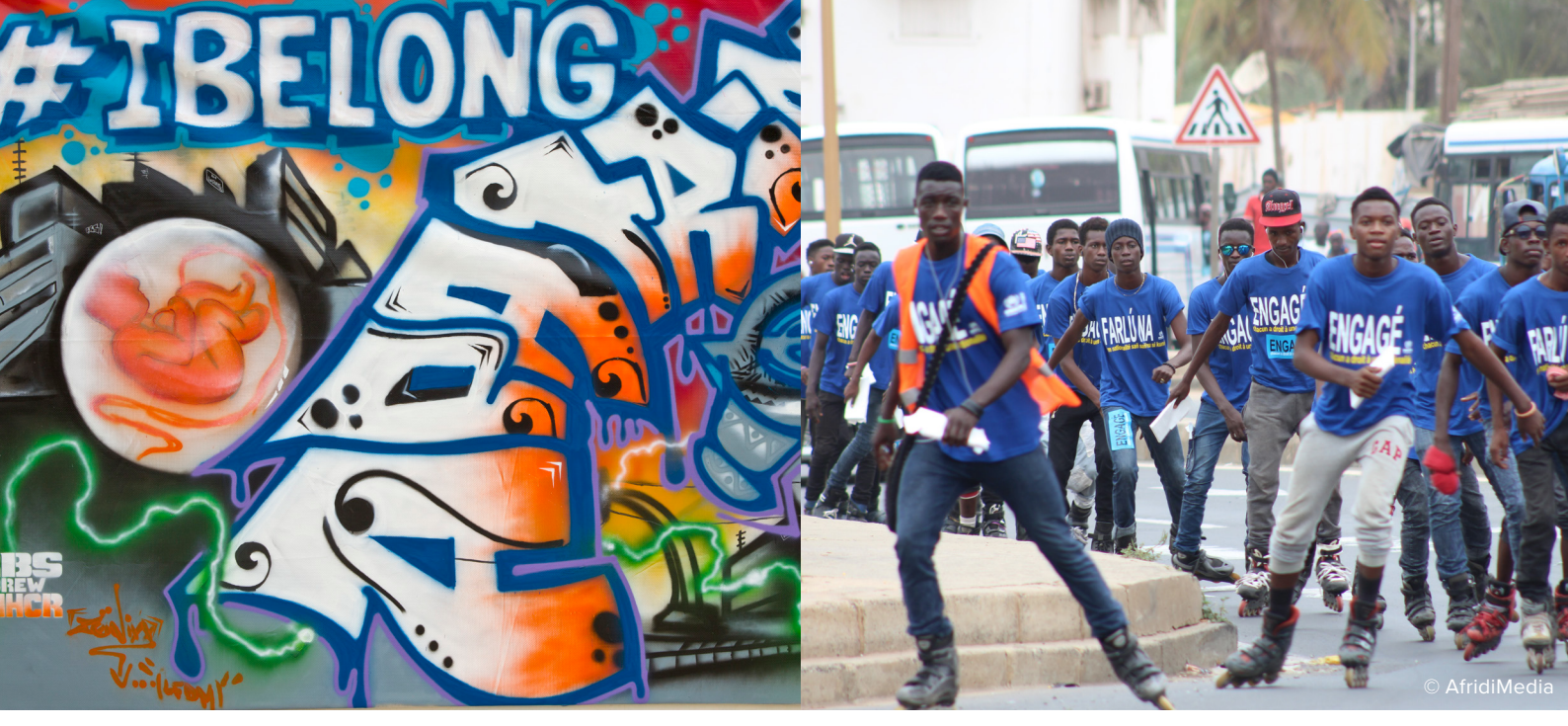
Graffiti art and roller skaters promoting the #IBelong Campaign in Senegal.