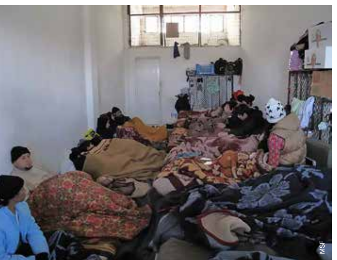
Detained migrants and asylum seekers in Greece.

very limited or no possibility to spend time outdoors. In nearly every detention centre there was no facility for isolating patients with communicable diseases.