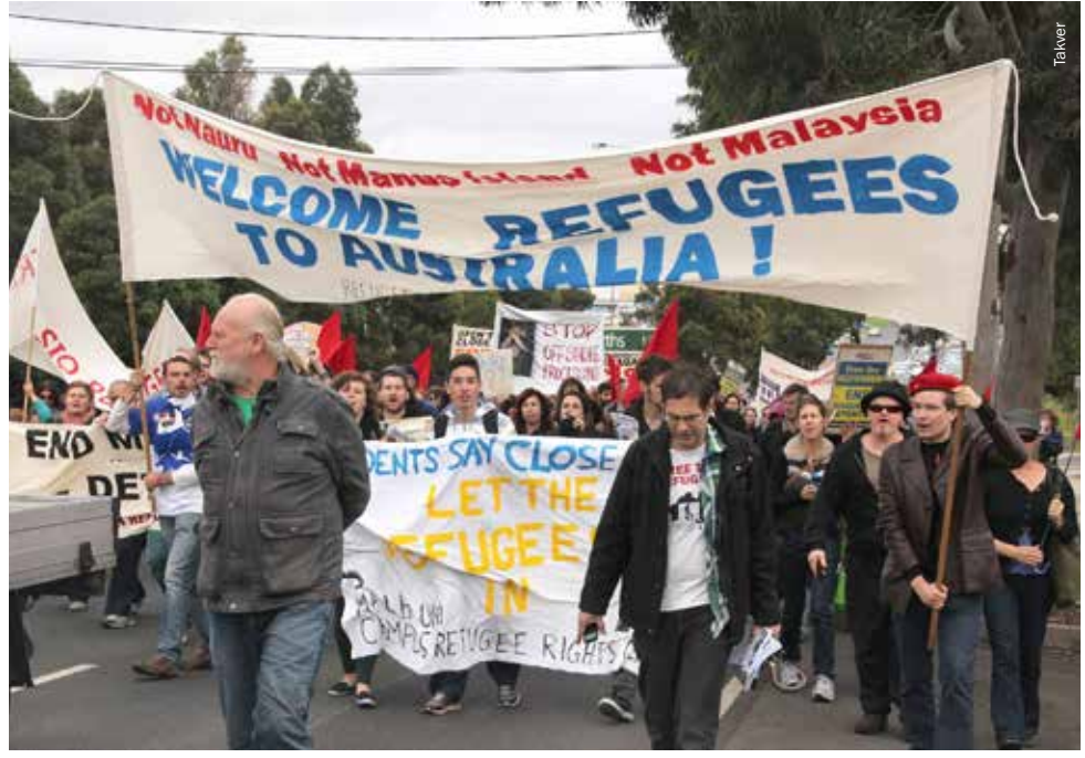
Rally organised by the Refugee Action Collective (Victoria) outside Broadmeadows Melbourne Immigration Transit Accommodation Centre, April 2013.

In early 2010, a group of advocates set about exploring appropriate models for the community detention of unaccompanied asylum-seeking minors. Consultations were held with a wide variety of stakeholders and providers of youth services; once a model was agreed upon and accommodation and service providers identified, a proposal was