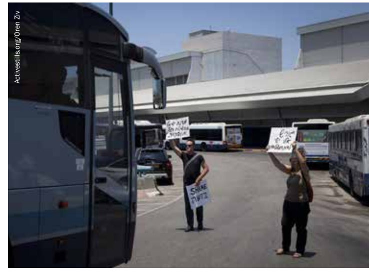
Israeli activists block a bus taking South Sudanese refugees to Ben Gurion airport to be deported to South Sudan.

lacking access to a fair asylum policy, and especially should not be applied in the case of countries like Eritrea and Sudan where returnees face a serious risk of persecution, or without inquiring as to whether the situation in the newly independent country of South