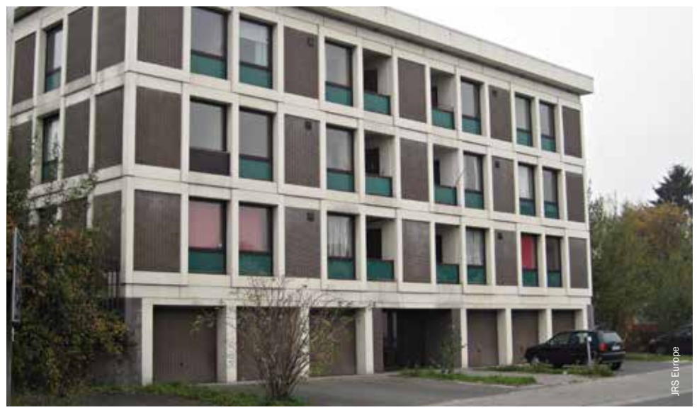
Building used to accommodate families in private apartments, plus office for a case worker. Tubize, Belgium.

Fifthly, there should be an emphasis on all possible outcomes. Alternatives to