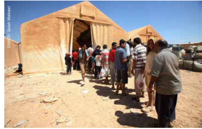
Syrian refugees queue for relief items at Za'atari camp, Jordan.

There are some stark examples of organisations with solutions looking for problems. In Lebanon the population's biggest burden is spiralling rents, made worse by reducing work opportunities. They are not generally food insecure, yet they receive cash vouchers ($27 a month) from the World Food Programme (WFP) which cover only a part of the actual food consumption of people who are used to spending far more per month on essentials. Far from being a life-saving intervention, the voucher is just one of