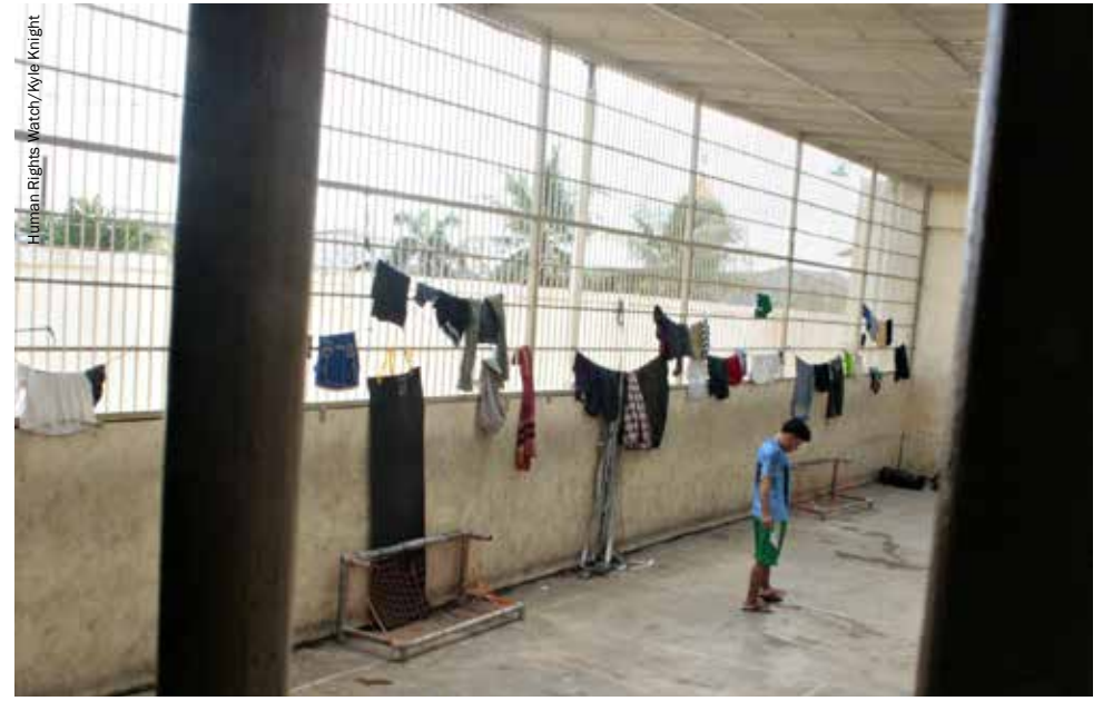
An Afghan asylum seeker walks in the courtyard used for outdoor recreation time at Belawan Immigration Detention Centre, North Sumatra.

UNHCR's Detention Guidelines emphasise that seeking asylum is not an unlawful act and, as such, even those who have entered or