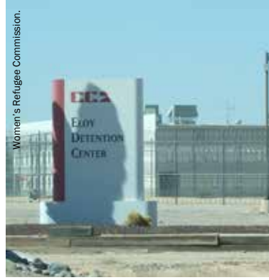
Eloy Detention Center, Arizona, US.

interventions to support compliance with conditions of release (e.g., appearances at removal hearings) in a manner that is more costeffective than detention, respects human rights, improves integration