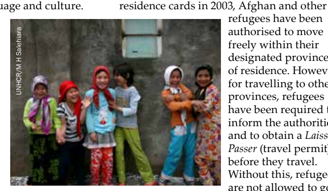
Afghan refugee girls in Torbate-Jam settlement, Iran.

They successfully entered the local job market although, due to the nature of the jobs they found, a significant number of Afghan refugees have been working in remote areas while their families stayed in the cities. Inevitably these refugees travelled back and forth between their workplaces and places of residence.