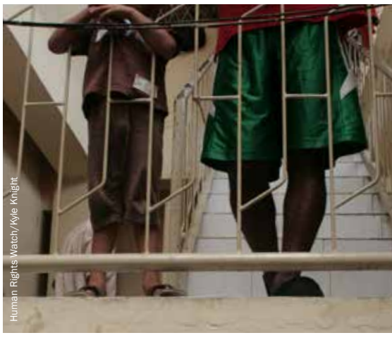
Two asylum-seeking boys at Belawan Immigration Detention Centre, North Sumatra.

months.... I want to be released and I don't want to stay longer." Sharzad shared her cell with six adult women to whom she was not related and with whom she was unable to communicate.