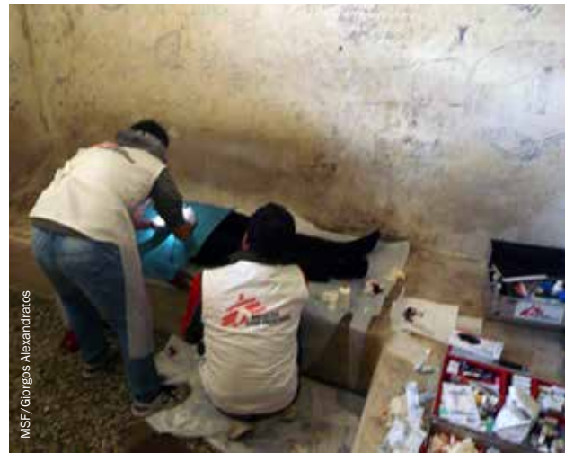
Providing medical care in detention, Greece.

Working in closed settings like prisons or detention centres poses ethical challenges for humanitarian organisations because of the risk of being perceived by detainees as complicit in the detention system. Thus this work requires a high level of responsibility and vigilance to safeguard the interest of patients' physical and mental health, in a context where operations fully depend