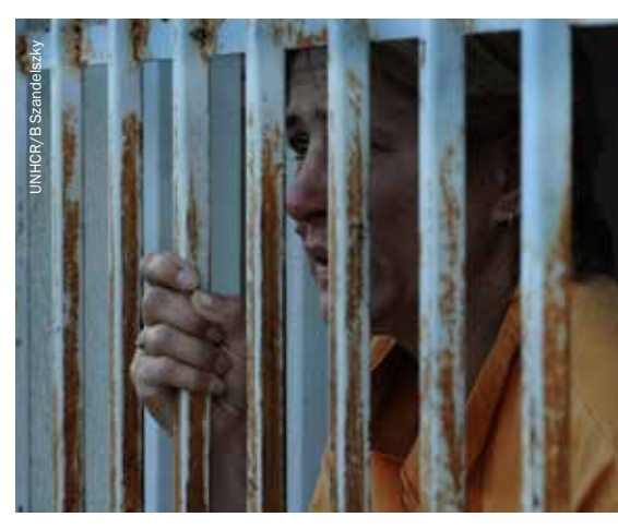
Asylum-seeking woman from Ukraine looking through the bars of the detention centre in Medvedov, Slovakia.

to gender and particular tasks in the prison which are gender-specific. There is no equivalent published policy guidance in the UK's immigration removal centres which detain women, and the facilities do not make public the proportion of female staff they employ.