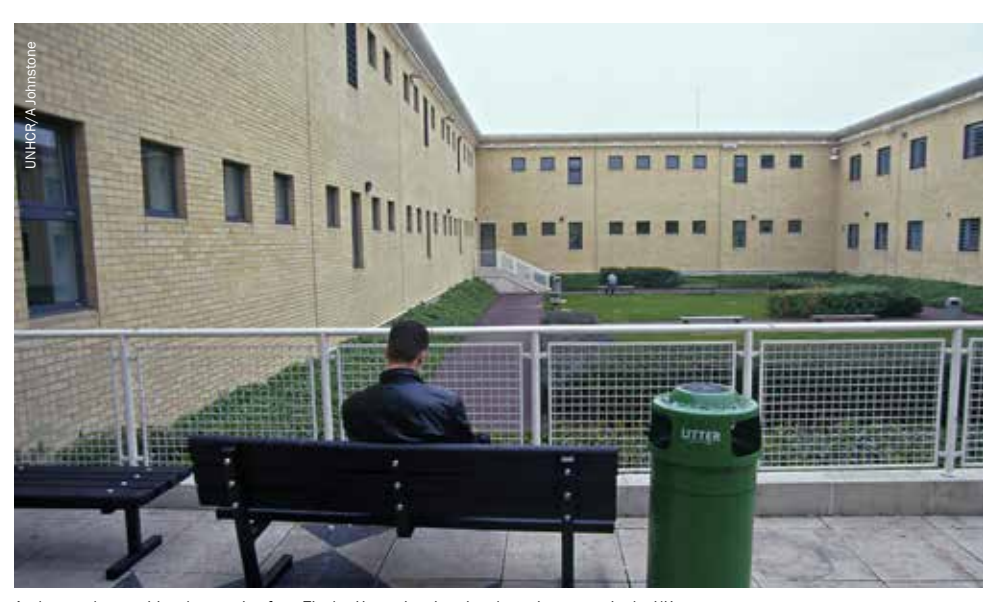
Asylum seeker awaiting deportation from Tinsley House immigration detention centre in the UK

trust, taking time throughout the immigration process to explore all potential long-term options, including leave to remain, assisted return and possibilities in third countries. These programmes have largely met the needs of governments as well as migrants, since very few migrants absconded and large proportions of those refused leave to remain decided to take up assisted return.