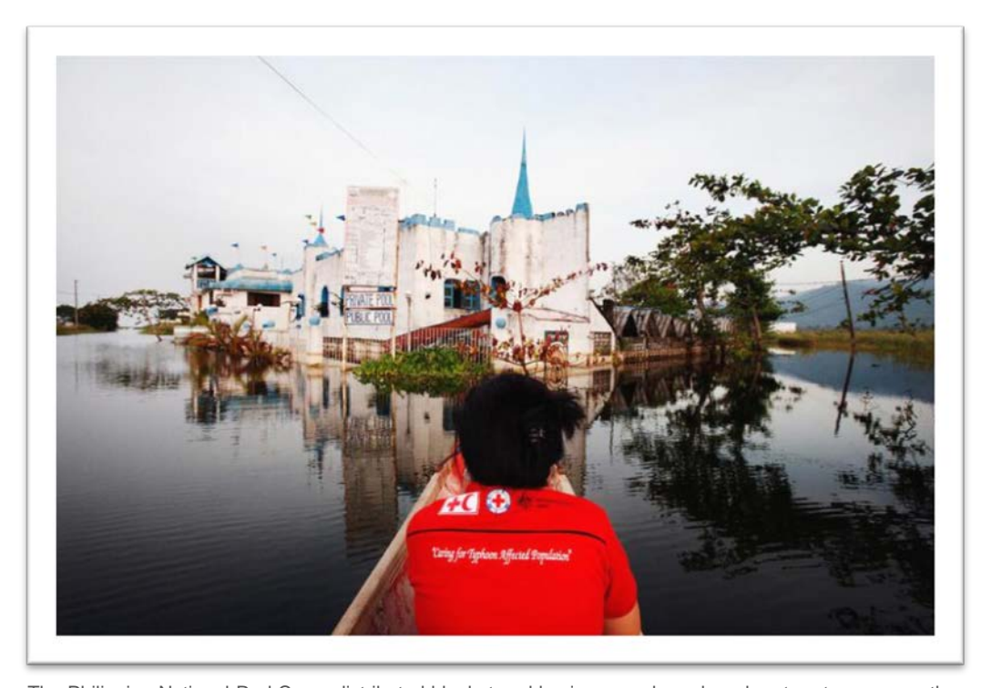
The Philippine National Red Cross distributed blanket and hygiene goods and made a tour to reassess the damages and the condition of the evacuation centers after typhoon Ondoy hit Calamba city in the province of Laguna, Philippines in 2009.

When there are sub-national clusters, each of the hubs should be treated as a separate entity and reported against by the partners locally present in that cluster and the sub-national Cluster Coordinator. This is a separate exercise to that performed by the national cluster as it brings additional detail and insight.