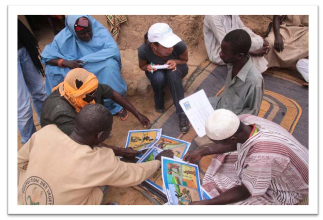
Aid workers conducting cholera awareness campaigns to at-risk communities in Niger. In 2012, nearly 4,000 cholera cases and over 80 deaths have been reported, mostly along the Niger River which recently flooded after heavy rains in the west of the country.

Finally, each cluster is also responsible for integrating early recovery from the outset of the humanitarian response. The RC/HC has the lead responsibility for ensuring early recovery issues are adequately addressed at country level, with the support of an Early Recovery Advisor. The Advisor works on inter-cluster early recovery issues for a more effective mainstreaming of early recovery across the clusters and to ensure that multidisciplinary issues, which cannot be tackled by individual clusters alone, are addressed through an Early Recovery Network<sup>13</sup>. Exceptionally, where early recovery areas are not covered by existing clusters or alternative mechanisms, the RC/HC may recommend a cluster be established in addition to the network to address those specific areas.