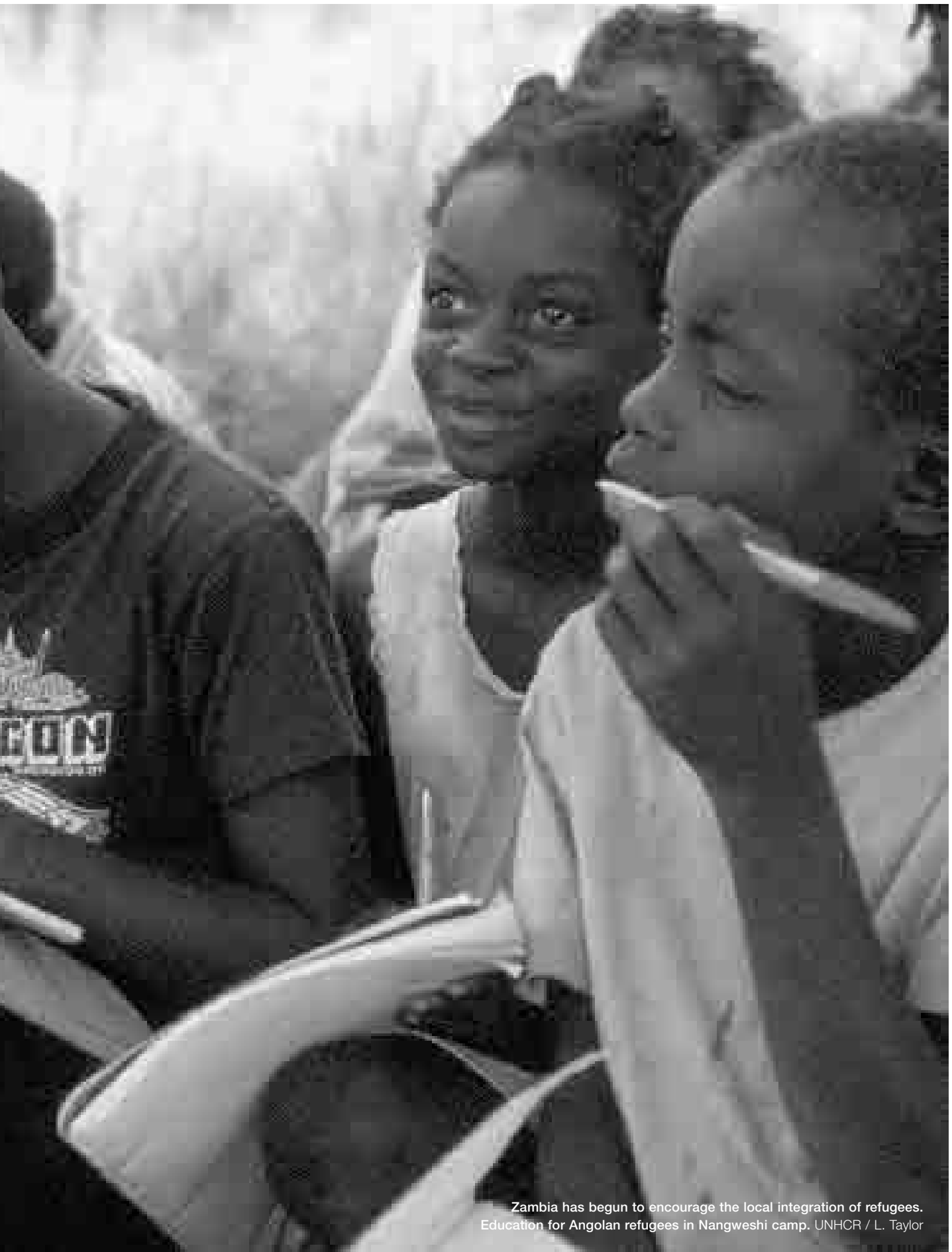
Zambia has begun to encourage the local integration of refugees. Education for Angolan refugees in Nangweshi camp.