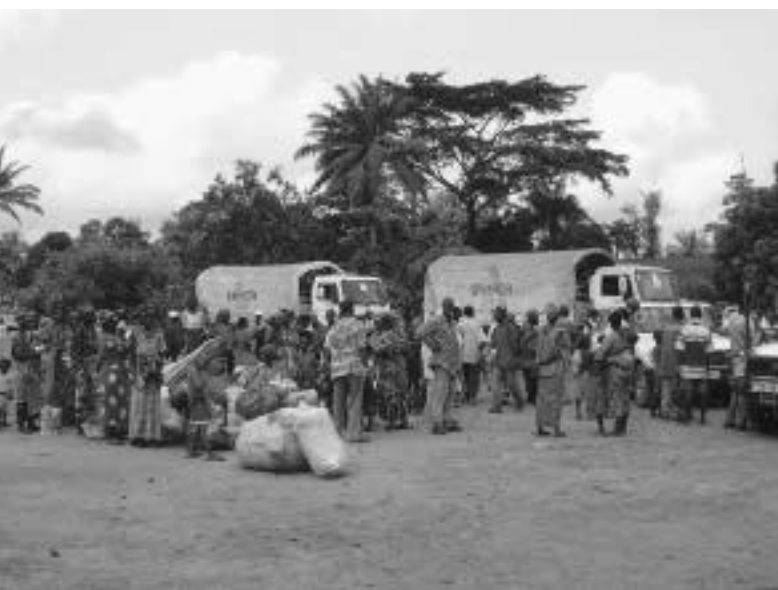
Sierra Leone: About 100,000 people have gone home since mid-2001. Here Sierra Leonean returnees arrive in their village.

The return of relative stability in the Republic of the Congo augurs well for the voluntary repatriation from Gabon of 17,555 Congolese refugees.