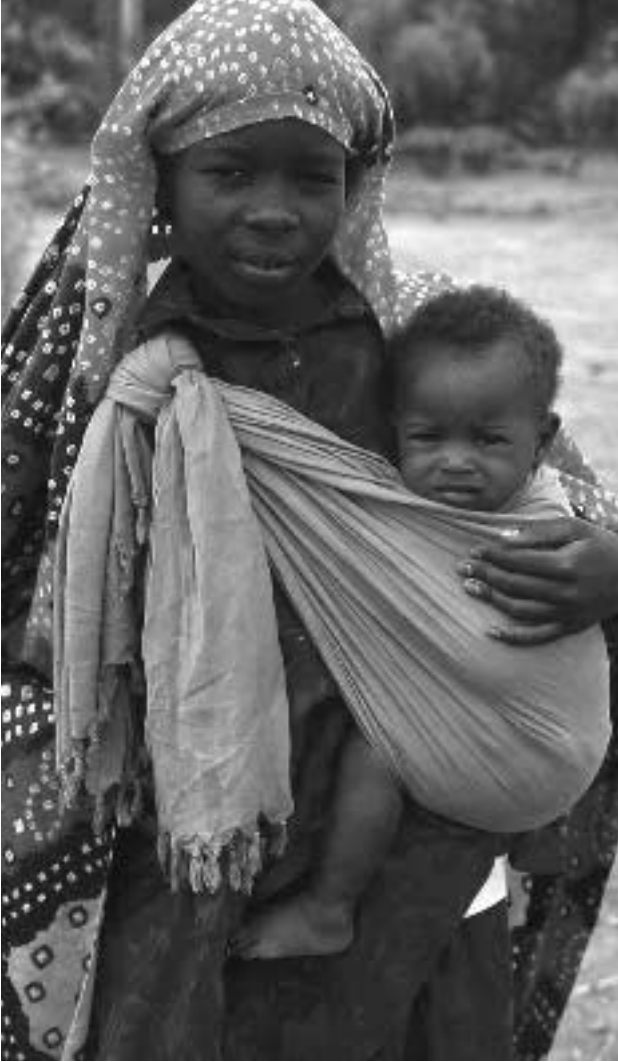
Kenya: Young girls often have to take care of their siblings. Somali Bantu in Kakuma camp.

pursue the repatriation effort by fielding missions in 2000 and 2001 to the areas of return of Somali refugees residing in Djibouti. Late in 2001, the President of “Somaliland” agreed to receive the Somaliland refugees from Djibouti. UNHCR and its partners immediately embarked on the registration of refugees wishing to return to their country of origin: from November 2001 to January 2002, 15,043 refugees registered for return. UNHCR established a plan of action in co-operation with “Somaliland” authorities and the Government of Djibouti to start the operation in January 2002.