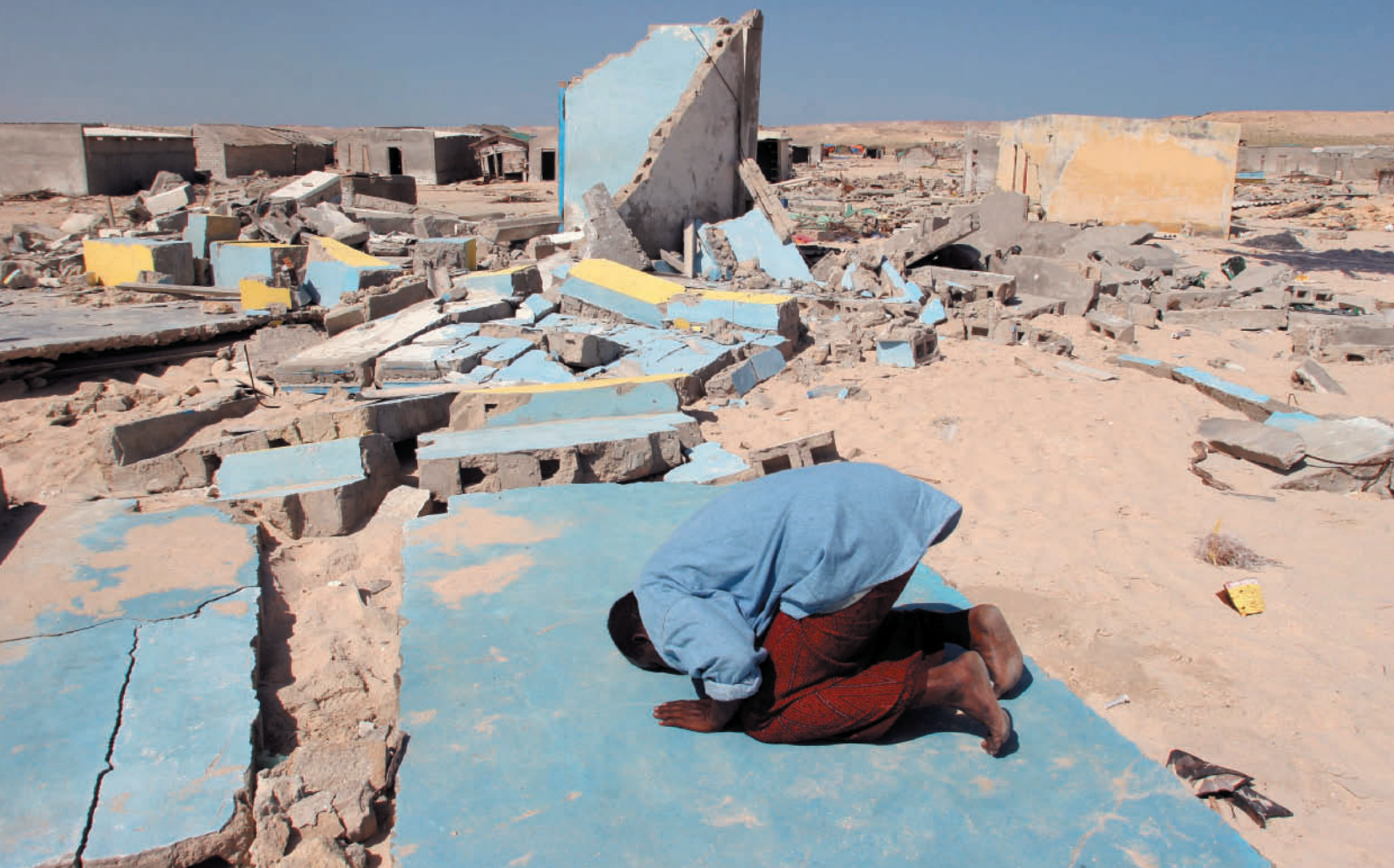
In the aftermath of the Indian Ocean Tsunami, a man prays on what is left of the mosque in Hafun village, North-West Somalia, one of the worst-hit areas in the country.

expanded three primary schools and procured a generator for a secondary school in Garowe, benefiting over 3,000 children. As a follow-up to the 2004 initiative entitled Together for Girls , individual support (school fees, uniforms and textbooks) was provided to over 700 vulnerable returnee girls to ensure school attendance.