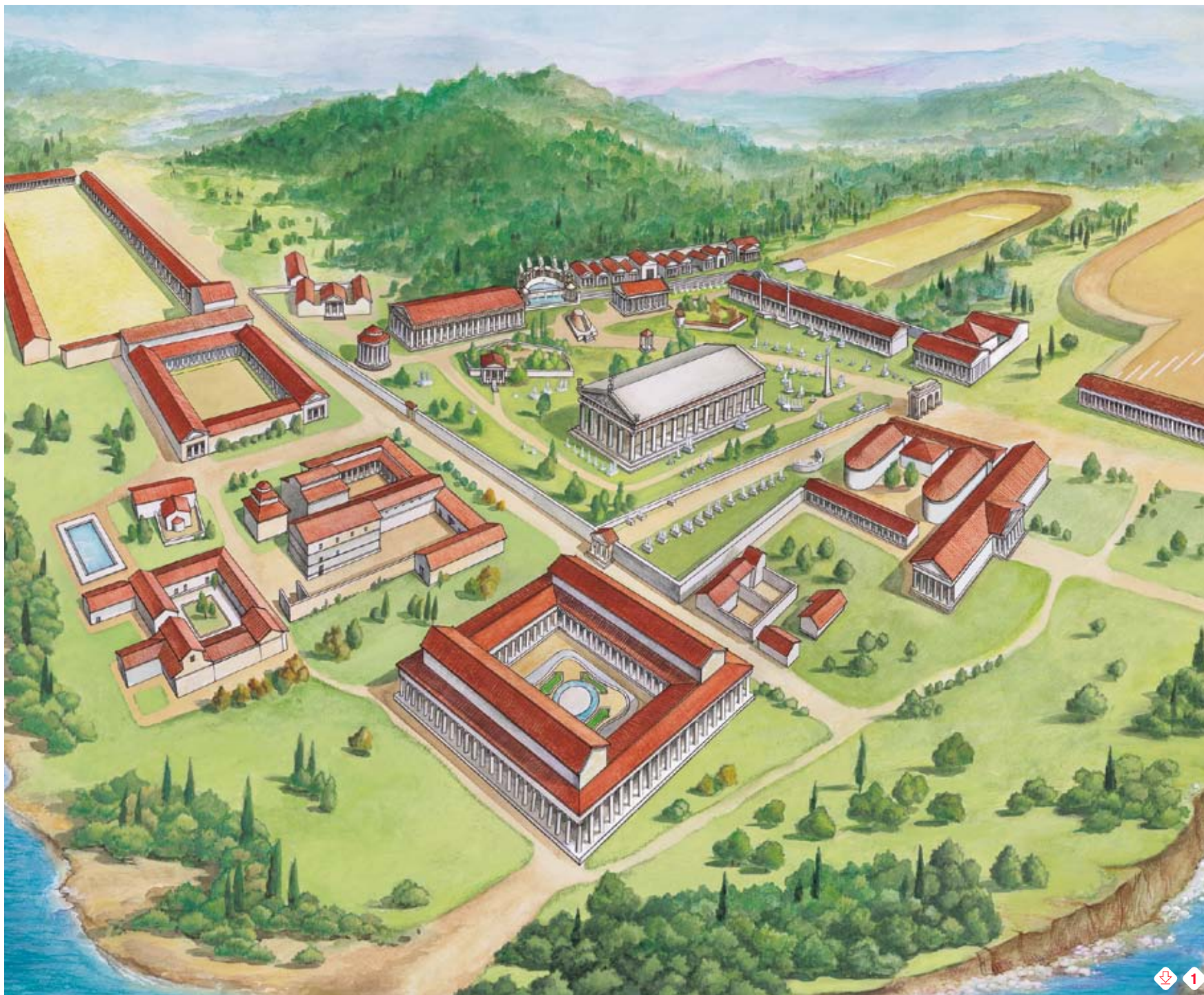
1. Reconstitution of the site of Olympia (around the 3rd century BC).