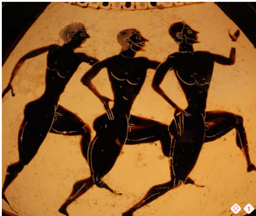
1. Representation of the races

These three disciplines were only practised as part of the pentathlon. Running and wrestling, on the other hand, were also practised as individual disciplines.