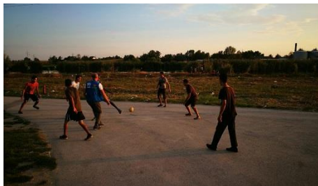
Playing football outside the RAP, Subotica (Serbia)@HCIT, 08 September 2016

The total number of asylum seekers in all locations in the North continues shrinking, now below 500. Of those, less than 200 were still camping in the open on Serbian soil close to the two Hungarian “transit zones” of Horgos I and Kelebija. Close to two-thirds were women and children from Afghanistan, Iraq or Syria. The SCRM sheltered another 274 migrants, mainly single men from Pakistan (120) or Afghanistan (80), in the Refugee Aid Point (RAP) of Subotica.