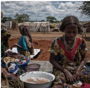
Central African Republic Regional Refugee Response Plan January - December 2015

2015 contributions (USD) as of 22 December 2015