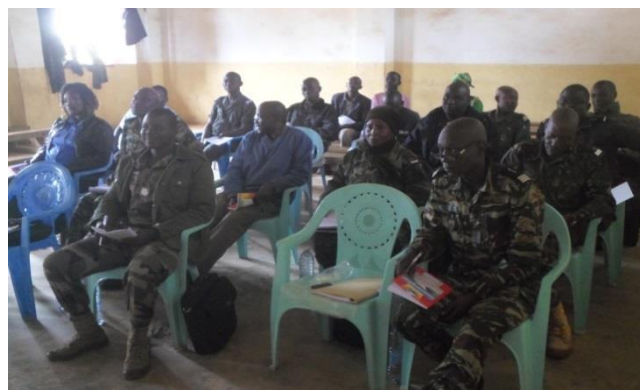
Training on human rights and SGBV to representatives of police, and gendarmerie in Cantonnier, Béloko and Baboua, Nana Mambere province. May 2016

Spontaneous Return of CAR refugees from Chad, Cameroon and the DRC: From January to May 2016, UNHCR and its partners have registered 6,588 spontaneous returnees from Cameroon, Chad and the Democratic Republic of Congo. The main areas of return identified are Bouar, Baboua, Berberati, Gamboula, Paoua, Kabo, Kaga Bandoro and Kouango sub prefectures of Nana Mambere, Mambere Kadei, Ouham Pende, Ouham, Nana Gribizi and Ouaka prefectures.