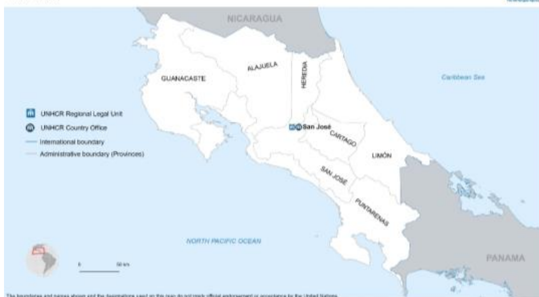
UNHCR Costa Rica: Operational Map June 2016

The boundaries and names shown and the designations used on this map do not imply official endorsement or acceptance by the United Nations.