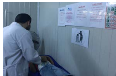
The process of handing over of the primary health care centre in Darashakran camp, Erbil Governorate, to the Department of Health is ongoing.

Access to reproductive health care services remains a key concern across the region with around four million women and girls of reproductive age assessed to be in need of special attention. Among children, improvement of health care services for newborns and need for routine immunization against vaccine-preventable illness remains a priority. The need for health and hygiene messaging is also a key focus area.