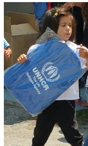
A young beneficiary receives a school bag distributed as part of the informal education project for children and youth

Women and men tearoom. The women and men refugee committees at the site decided to focus on the construction of two separate tearoom areas for women and men to have tea and discuss issues of interest for the community. The spaces are made of six Refugee Housing Units (RHUs) adjusted according to the needs of the refugees, with an open area for the men and a closed area for women, in order for the latter to maintain their privacy.