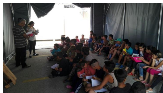
English class for children in Derveni site, run by the community

Shades and benches for multipurpose communal areas. The process for the provision of 70 shades and 124 benches has been finalized. The benches will be distributed to sites within this month. With the areas, refugees will enjoy improved waiting spaces for protection counselling and seating areas outside the tented space. The construction of 70 shades will provide additional shaded spaces for refugees to undertake various recreational activities, and group discussions.