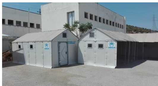
Refuge Housing Units used for the community-based school in Elefsina