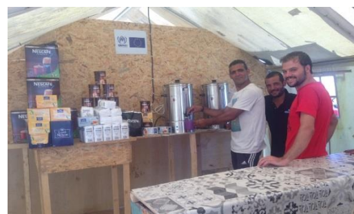
Tea Shop Opening in Katsikas

Opening of a tea shop. The three community managers of the Tea Shop are preparing and serving tea and coffee to more than 100 refugees twice a day. People from all ethnicity groups, come every morning and afternoon to enjoy the space, interact and have discussions under the shade.