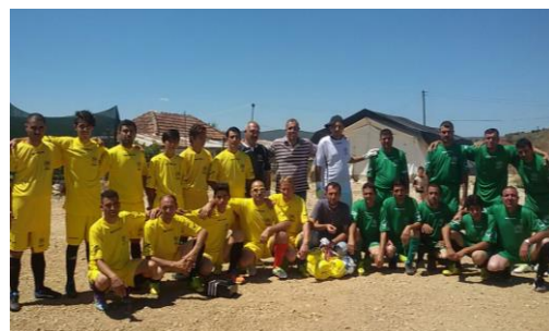
Community Football Team in Faneromeni

the potential to encourage children to partake in future sport activities.