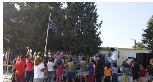
Sound check at Diavata site for the concert organized to celebrate the end of the holy month of Ramadan

“Patoo” project. Refugees having skills in creating traditional patoo rugs and shawls will be supported with materials. 40 women are expected to benefit from this project which could then also be exposed at the Thessaloniki Traditional Art Festival.