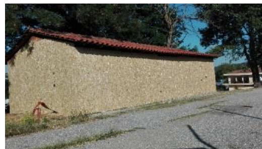
Refurbished Women Centre at Petra Olympou site

Music project. A team of 10 Afghan refugees will be provided with musical instruments with the other communities in the site. Musical instrument and various supplies planned for procurement at the end of August.