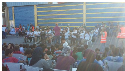
Nea Kavala music festival for Eid with Philharmonic Orchestra of the Municipality of Thessaloniki