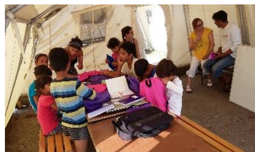
School supplies distributed for English lessons at Vagiochori

Sewing classes for women. The project targets refugee women in groups of 20 women. Five sewing machines were procured and transported to the site on 29 August. A local cooperation agreement was established with an association working in the camp (IsraAID) and willing to support with the management of the materials and the workshop lessons.