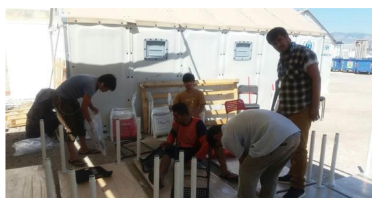
Refugees in Elefsina work to construct the community-based school

Community based school. UNHCR and refugees have been working together to assembly tables and chairs provided by UNHCR for the community based school in Elefsina site. The community-school will serve children and adults with Greek and English classes.