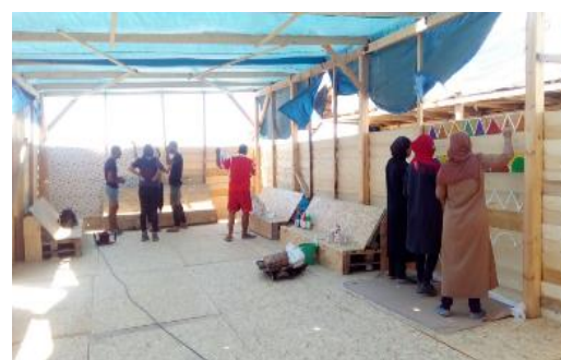
Women Community Centre being finalized by the refugee community in Nea Kavala