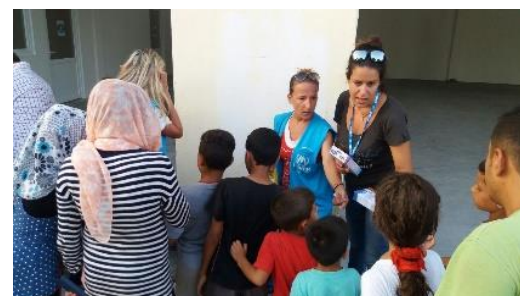
UNHCR colleagues welcoming children to the new site in Kavala