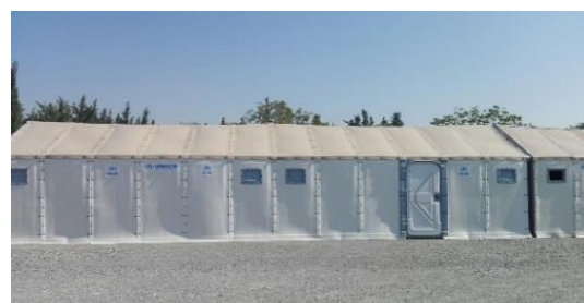
Modified Refugee Housing Units serving as a gym in Vasilika/Redestos site

Communal Gym. Refugees who were previously working as gym instructors in Syria had built sport equipment with recycled materials. To support this initiative, gym equipment were purchased and will be installed. Moreover, Refugee Housing Units (RHU) were modified to serve as a gym where refugees can participate in different kind of sports. Materials will be guarded by community watchmen and free courses will be given by the refugees who used to be gym instructors.