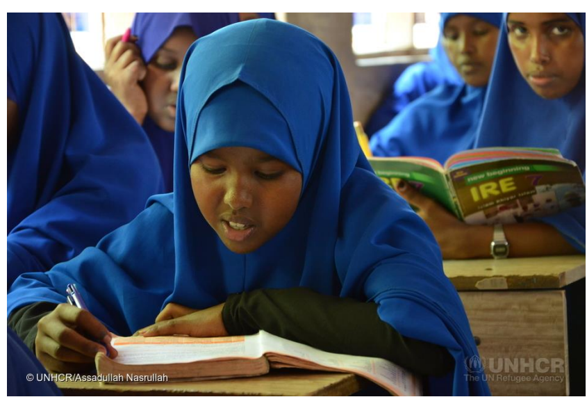
Students from Central Primary School in Hagadera camp in Dadaab, Kenya.