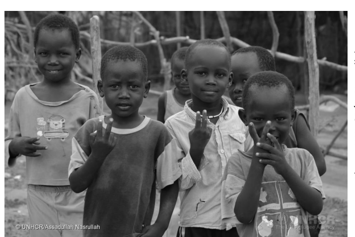
Refugee children from Gambella community of Ethiopia living in Ifo camp of Dadaab.