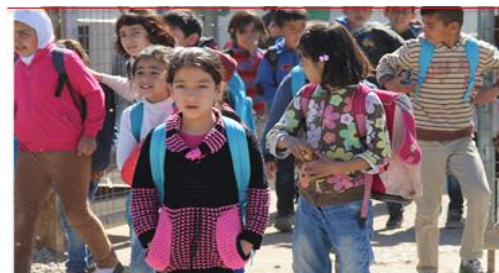
After school day in Kawergosk refugee camp, Erbil.

In Egypt, five field visits were conducted by the education unit as part of the monitoring plan to all Syrian community schools. 3RP partners identified 38 cases of Syrian children with learning difficulties which received medical assistance. Also, the direct assistance committee approved 21 cases out of 25 to be provided with direct assistance including wheel chairs, hearing aids, and eye glasses. A five days screening for nearly 700 Syrian children with learning difficulties also took place in two schools in 6 October district.