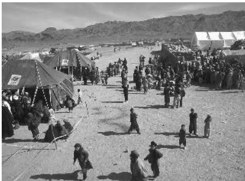
Pakistan: Having fled the violence in their country, Afghan refugees are seen here at a camp in neighbouring Pakistan.

At the end of the year, all the old assumptions were jettisoned. The apparent collapse of the Taliban and the signing of the Bonn Agreement establishing the Interim Administration brought a new spirit of optimism, and generous international offers of help to set Afghanistan back on its feet.