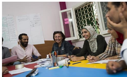
Workshop on livelihoods activities, Photo/UNHCR David Degner