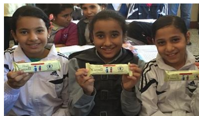
Syrian Children in public school in Damietta, Photo/ WFP