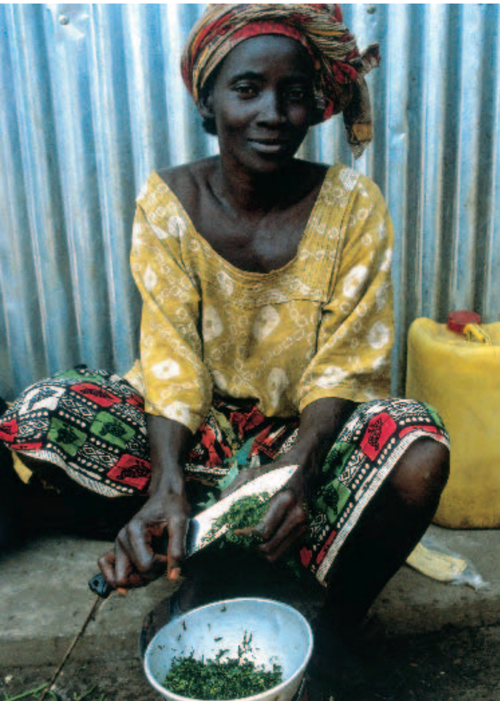
A returnee from Guinea living in a temporary settlement for IDPs and returnees.

tainable remunerative activity. Among Liberian refugees, medical and psychological assistance was provided to vulnerable individuals and survivors of sexual and gender-based violence. UNHCR raised awareness of human rights issues, reproductive health and HIV/AIDS risks. Skills training activities were implemented in the camps, benefiting some 1,350 refugees. An 11-member child protection unit was set up in Jembe camp. 40 refugee children were traced and re-united with their families. Some 20 per cent of the traumatised children received counselling.