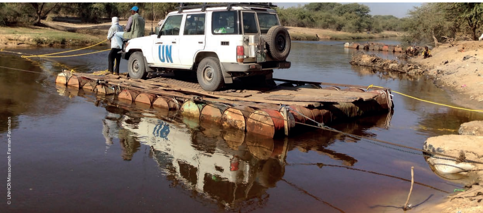
Crossing at Forcolom to reach Nigerian refugees living in Ngouboua, Chad.

UNHCR's Headquarters staff, located in Geneva, Budapest, Copenhagen and other regional capitals, work to ensure that the Office carries out its mandate in an effective, coherent and transparent manner.