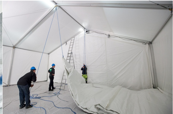
Now pull ropes at both ends simultaneously to lift the roof cover.