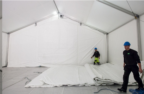
Roll fabric out towards side wall

NB! Make sure the flap with Velcro faces the gable wall.