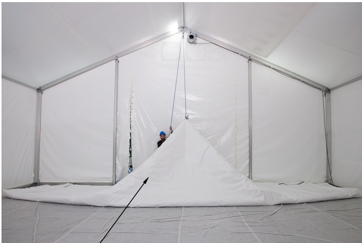
O.B.Wiik insulated inner cover