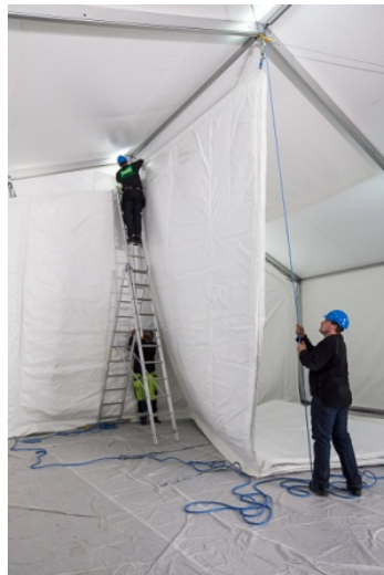
When the fabric is all up, fix it with the snap hook to the wire at the ridge.