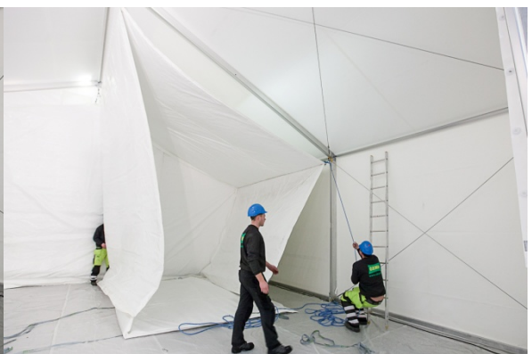
Follow the same procedure to lift the cover to the corner. Pull the ropes and hold until its fixed.