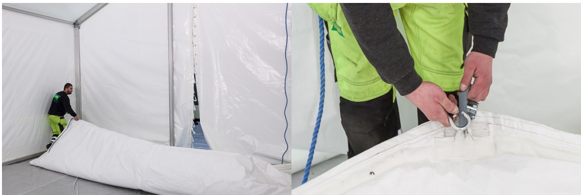
Fold top of cover backwards close to gable.