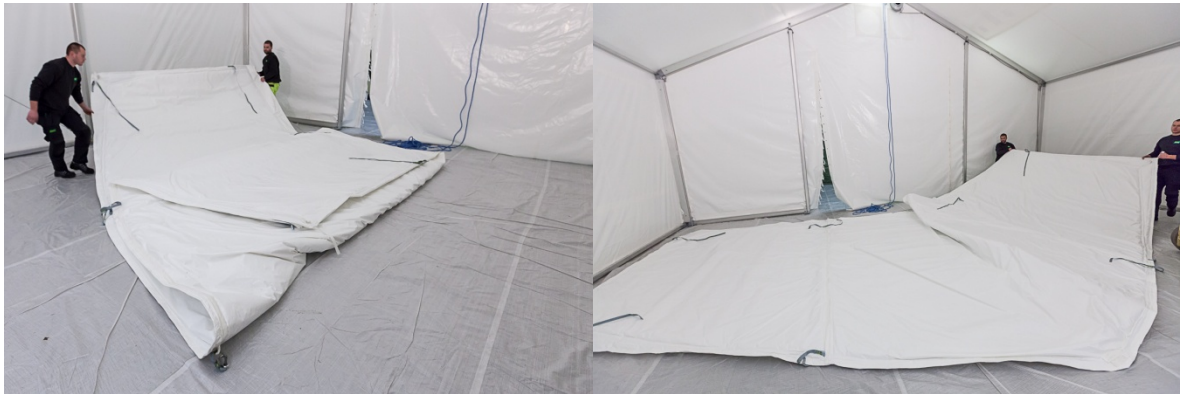
Fold out cover to both sides