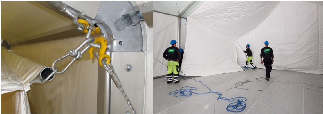
Insulated inner cover secured by snap hook and shackle.