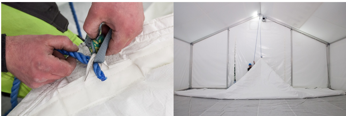
Thread one end of rope through loop and fix it.