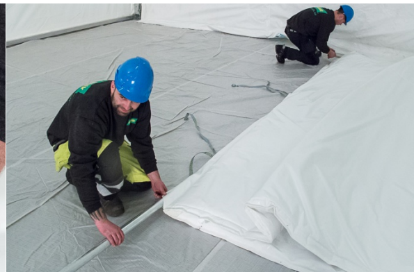
Thread the tension bar all the way through.