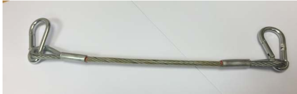
Wire 335mm with two snap hooks