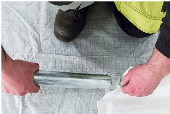
Enter tension bar into top pocket of fabric.