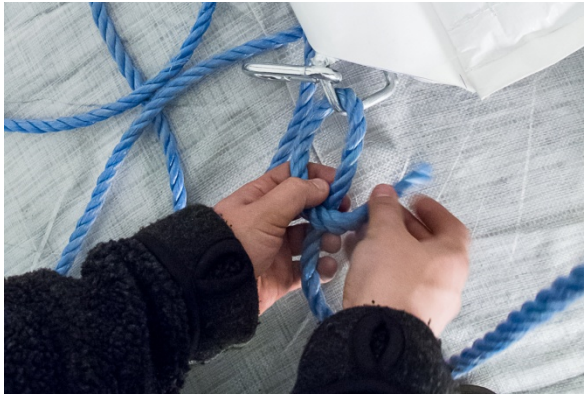
...and tie rope to the pipe.