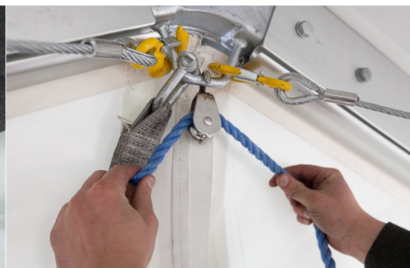
Attach pulleys to the lugs in both roof apex where the roof cover shall be hoisted.