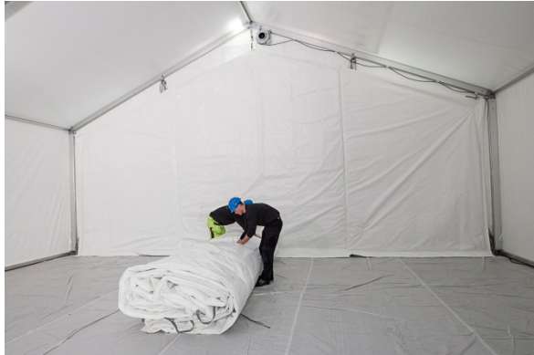
Put the fabric roll at center of the structure and towards gable.

NB! Make sure the flap with Velcro faces the gable wall.