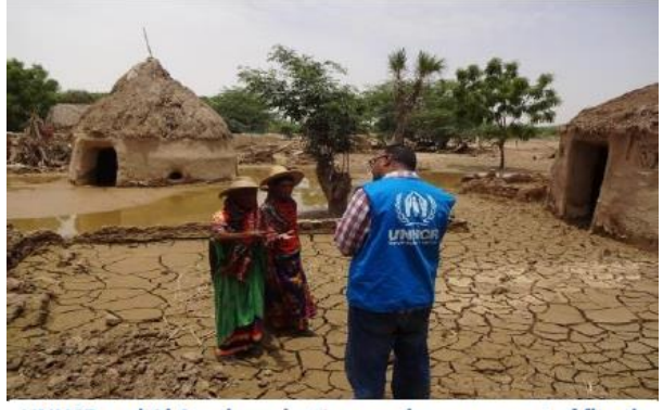
UNHCR and AI Amal conducting needs assessment of floods victims in Az Zuhrah District, AI Hudaydah governorate, 20 April 2016