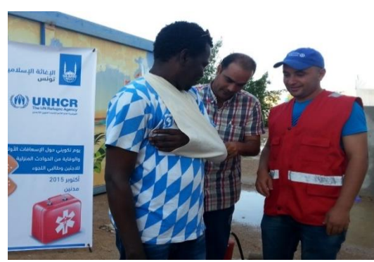
First aid training conducted on 15-16 October for refugees in Medenine.