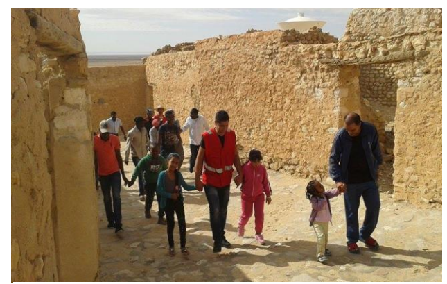
Go-and-see visit organized by UNHCR's partner IRT in Tozeur for 30 refugee children and youth, 29-31 October.