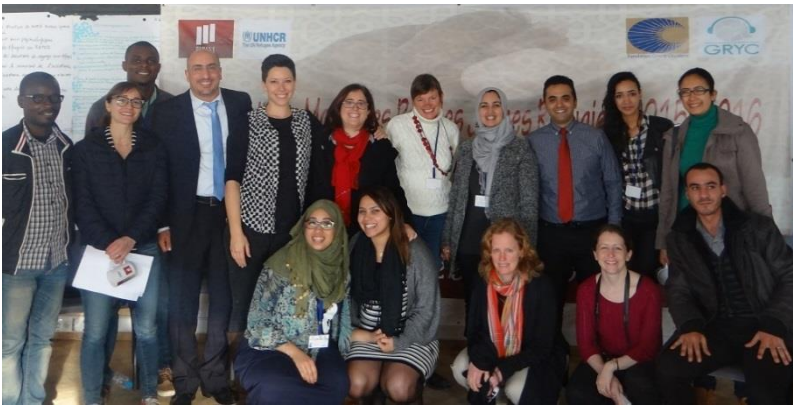
Global Refugee Youth Consultations' Facilitators from UNHCR, Women's Refugee Commission and Fondation Orient-Occident, January 2016