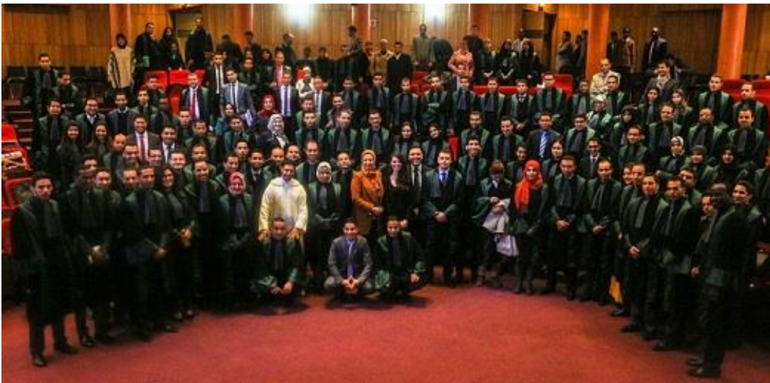
UNHCR Training Session at Institut Supérieur de la Magistrature (ISM) in Rabat, March 2016

Legislation: On 14 January, the Council of Government endorsed a draft law approving International Convention on the Protection of the Rights of All Migrant Workers and Members of their Families . The draft law is now at the Parliament for consideration.