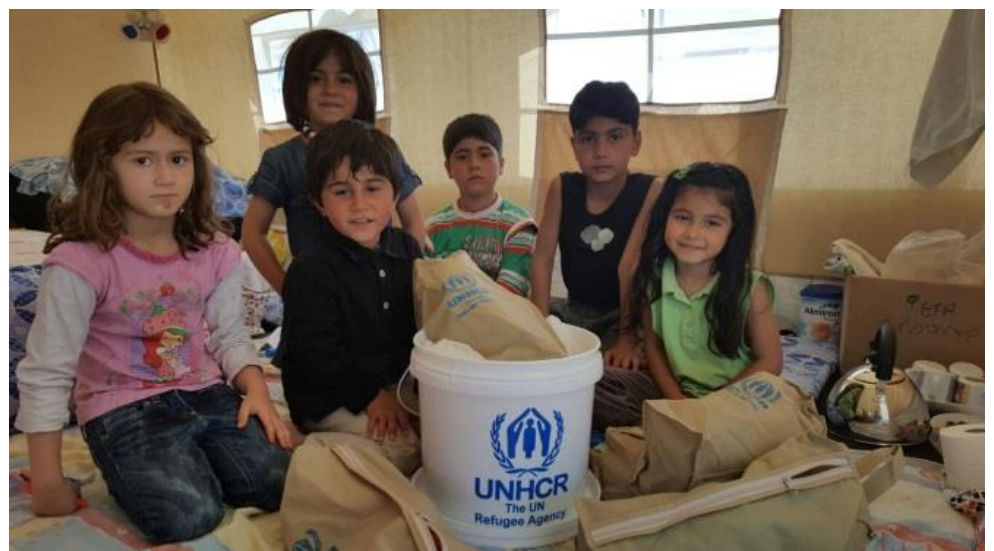
NFI distribution in Malakasa, Greece.