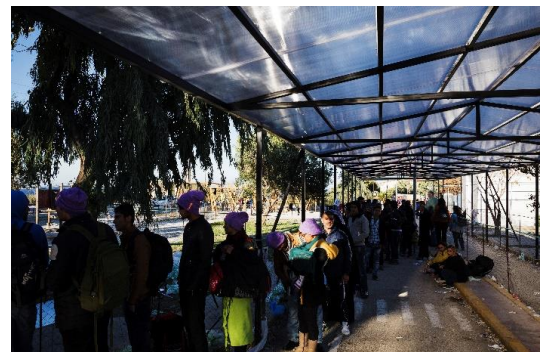
Winterized and shaded site in Kara Tepe