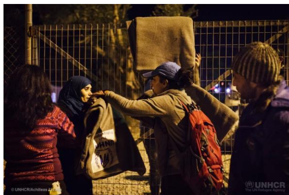
A UNHCR staff member is giving out blankets to refugees during a blanket distribution at the Kara Tepe site.