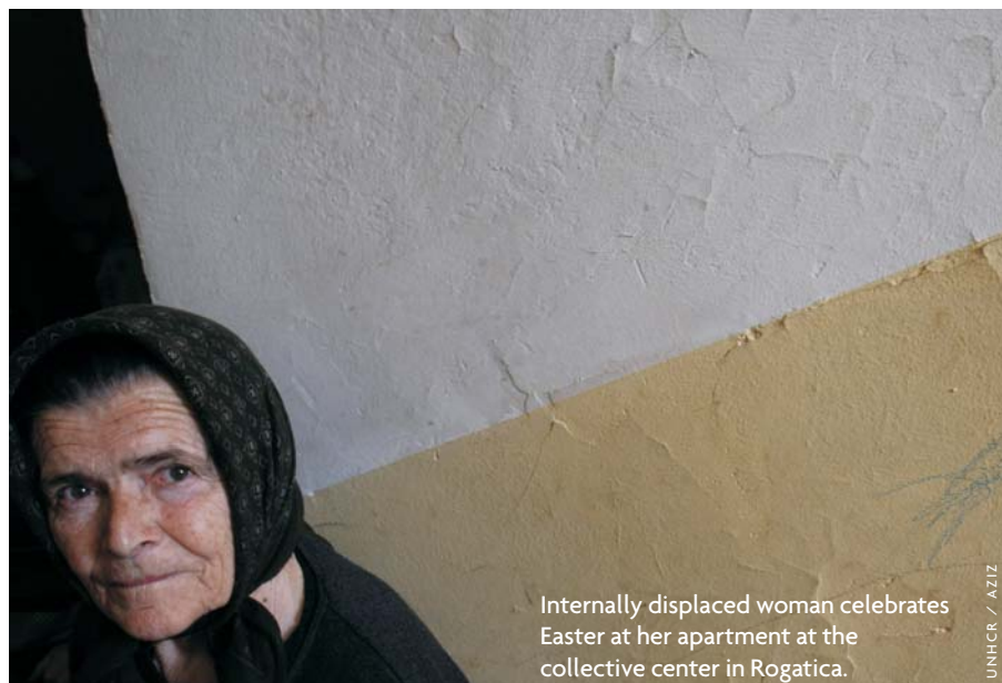
Internally displaced woman celebrates Easter at her apartment at the collective center in Rogatica.