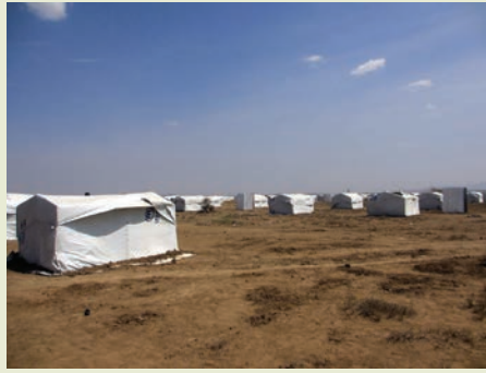
Shelters for new South Sudanese refugee arrivals in Kakuma, Kenya