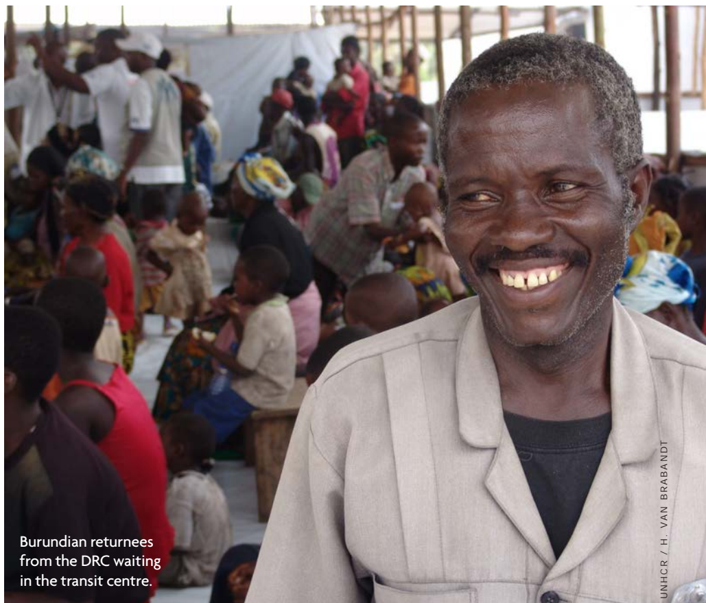
Burundian returnees from the DRC waiting in the transit centre.