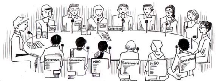
"The Annual Tripartite Consultation on Resettlement"

The ATCR is one of the few opportunities where NGOs can discuss issues freely with government representatives and UNHCR personnel on resettlement. NGOs are there as participants in recognition of the critical role they play in resettlement, both in countries of first asylum and in countries of resettlement.