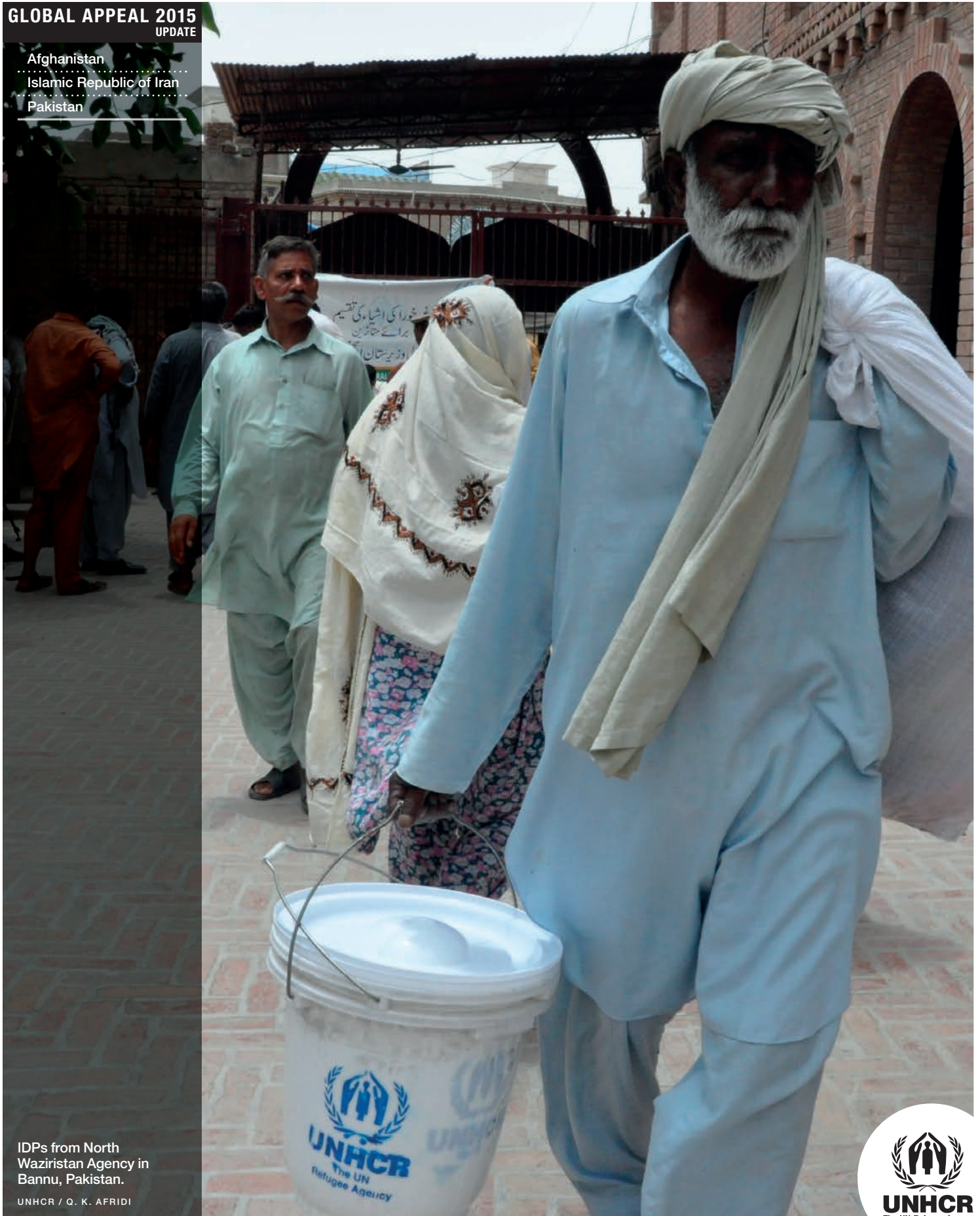
IDPs from North Waziristan Agency in Bannu, Pakistan.