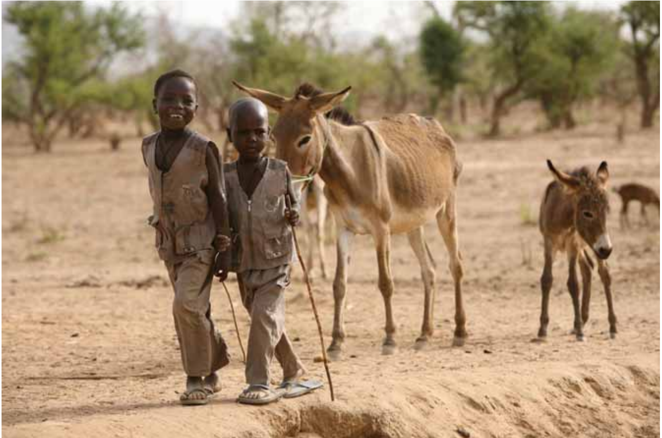
Internally displaced boys from Gouroukoun on their way to the water point. The donkeys will help bring water containers home.

these programmes were women. In the south, 75 per cent of adult refugees benefited from income-generating activities.