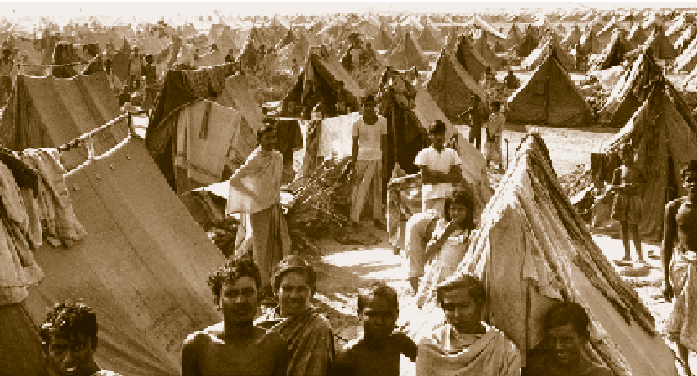
The millions of Bengali refugees who fled to India in 1971 were accommodated in some 800 camps. There were serious outbreaks of cholera in some camps due to the crowded conditions.

Increasingly, the government realized that it would need international assistance to cope with the massive refugee influx. On 23 April 1971, the Permanent Representative of India at the United Nations, Samar Sen, in a meeting with the UN Secretary-General, U Thant, requested international aid. 4 With growing international demands for assistance for the refugees, High Commissioner Sadruddin Aga Khan met with Secretary-General U Thant in the Swiss capital, Bern, on 26–27 April to discuss the situation. Two days later, the Secretary-General decided that UNHCR should act as the ‘Focal Point’ for the coordination of all UN assistance. For the first time in a humanitarian crisis, UNHCR was entrusted with the role of general coordinator.