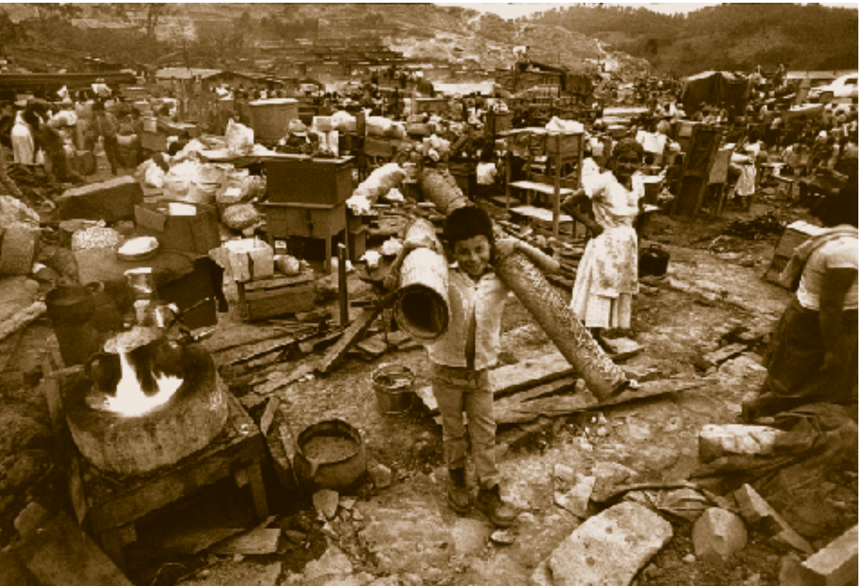
Salvadoran refugees dismantling their camp in Colomoncagua, Honduras, before repatriating.

CIREFCA process, which proved to be one of the most important innovations to come from the region.