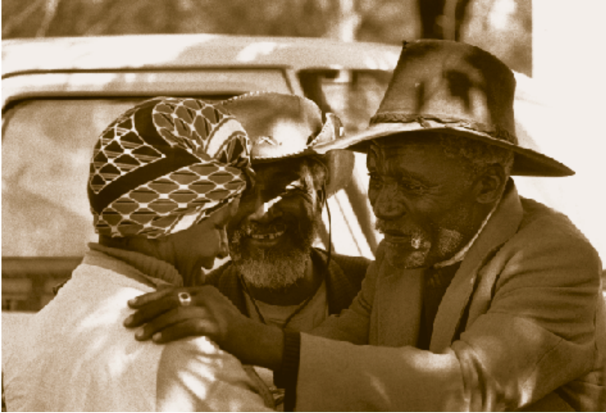
Namibian refugees arrive back in Ovamboland, Namibia, after years in exile.

defeated and expelled the SWAPO troops. Another problem was that the South West African police, which included some notoriously violent ‘counter-insurgency’ elements, were still being deployed by the South African-controlled Administrator General during the repatriation. These elements, known as Koevoets , continued to operate illegally in the north, particularly in Ovamboland. They spread fear, impeded refugee returns and prompted the UN Secretary-General to issue a formal complaint in June 1989. UNHCR sent protection missions to the area to monitor the situation. 1