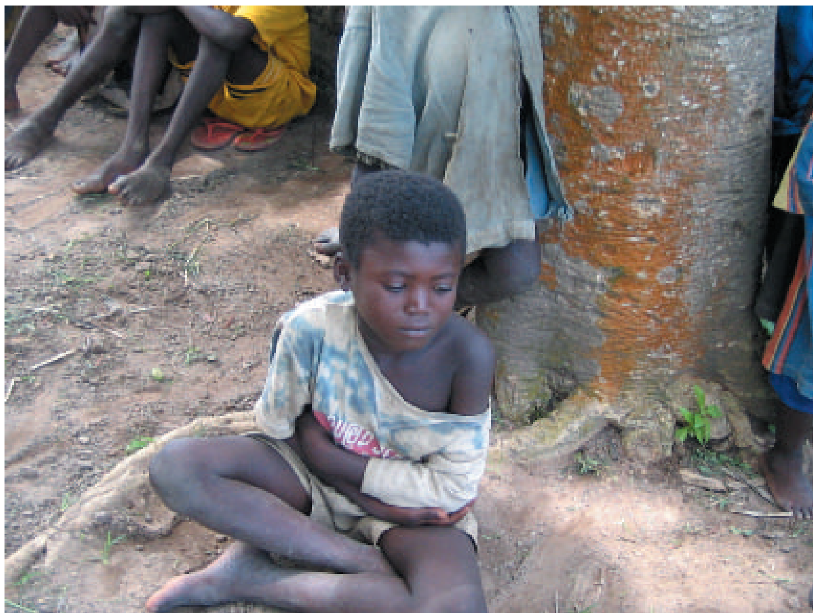
Chadian refugee child at Boubou site.

12,000 who fled in 2005. The CAR Government is expected to re-establish security with the support of the peace-keeping forces of the Economic and Monetary Community in Central Africa (CEMAC) and France, while the UNCT is expected to help improve basic socio-economic conditions. The UNCT will also encourage dialogue between Chadian pastoralists and CAR farmers to ensure respect for grazing routes and implement a project for the reintegration of former combatants. These interventions are expected to further encourage spontaneous returns. UNHCR will also establish a field presence in Bossangoa and Kaga Bandoro. Detailed information about the situation in areas of origin will be collected and