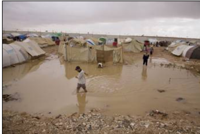
A Palestinian refugee in Al Tanf wades through water to reach some of his belongings after heavy rains caused the flooding of the camp

Heavy rain on the night of 28 October resulted in flooding at the two camps for Palestinians from Iraq stranded at the Syrian-Iraqi borders, causing tents to be inundated, sewage systems to overflow, the electricity supply to fail and the makeshift camp mosque to catch on fire after an electrical short cut.