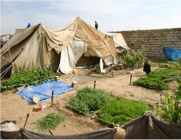
Iraqi IDP camp in Fallujah