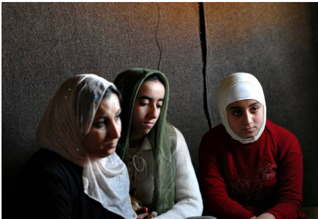
Ruwayshed refugee camp, Jordan, Iraqi refugee family