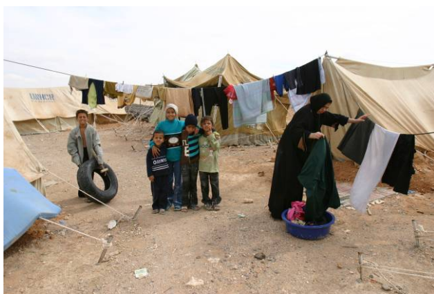
AL TANF refugee camp at the Iraq-Syria border