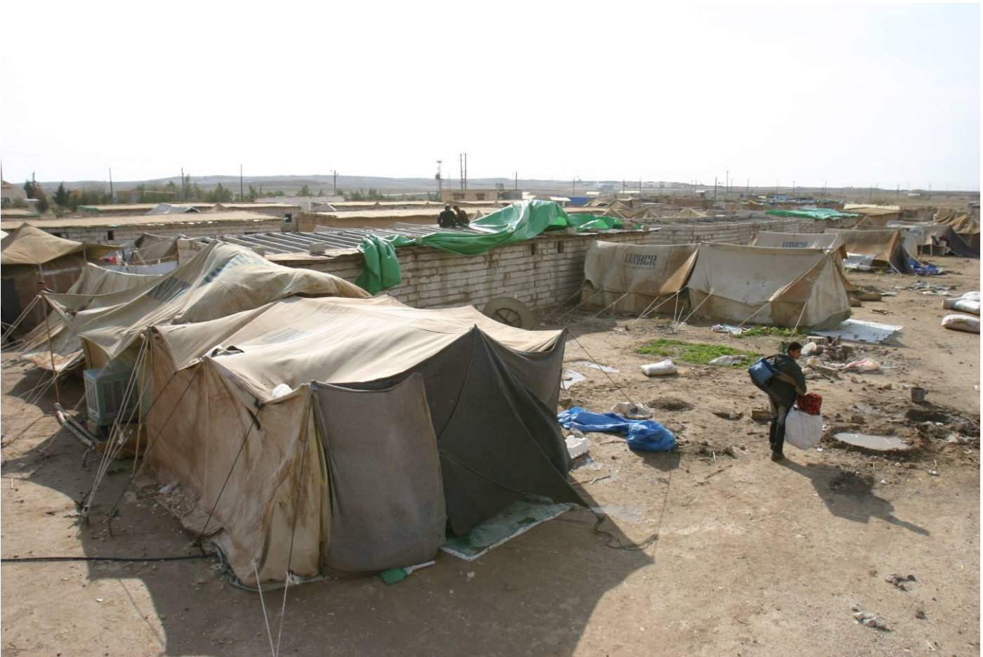
EL HOL Iraqi refugee camp at the Syria-Iraq border

In addition, the Office has developed a network of over 20 national and international NGO partners in Iraq and neighbouring countries.