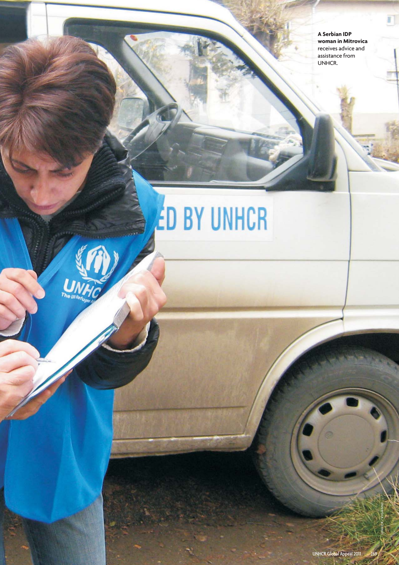
A Serbian IDP woman in Mitrovica receives advice and assistance from UNHCR.