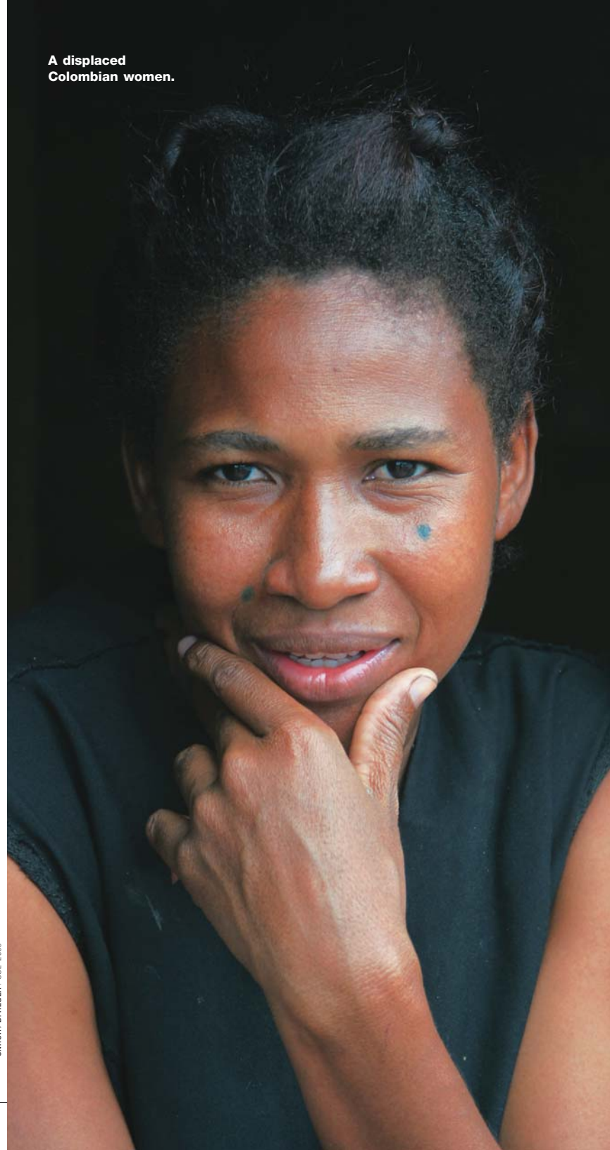
UNHCR / B. HEGER / COL • 2003