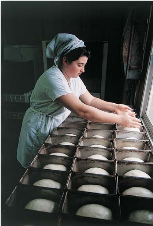
UNHCR / T. BOLSTAD / CS / CIS • 1996 Training can lead to jobs when women return home – work in a bakery in Chechnya.

Our approach is based on involving our partners as closely as possible in the development of WLL